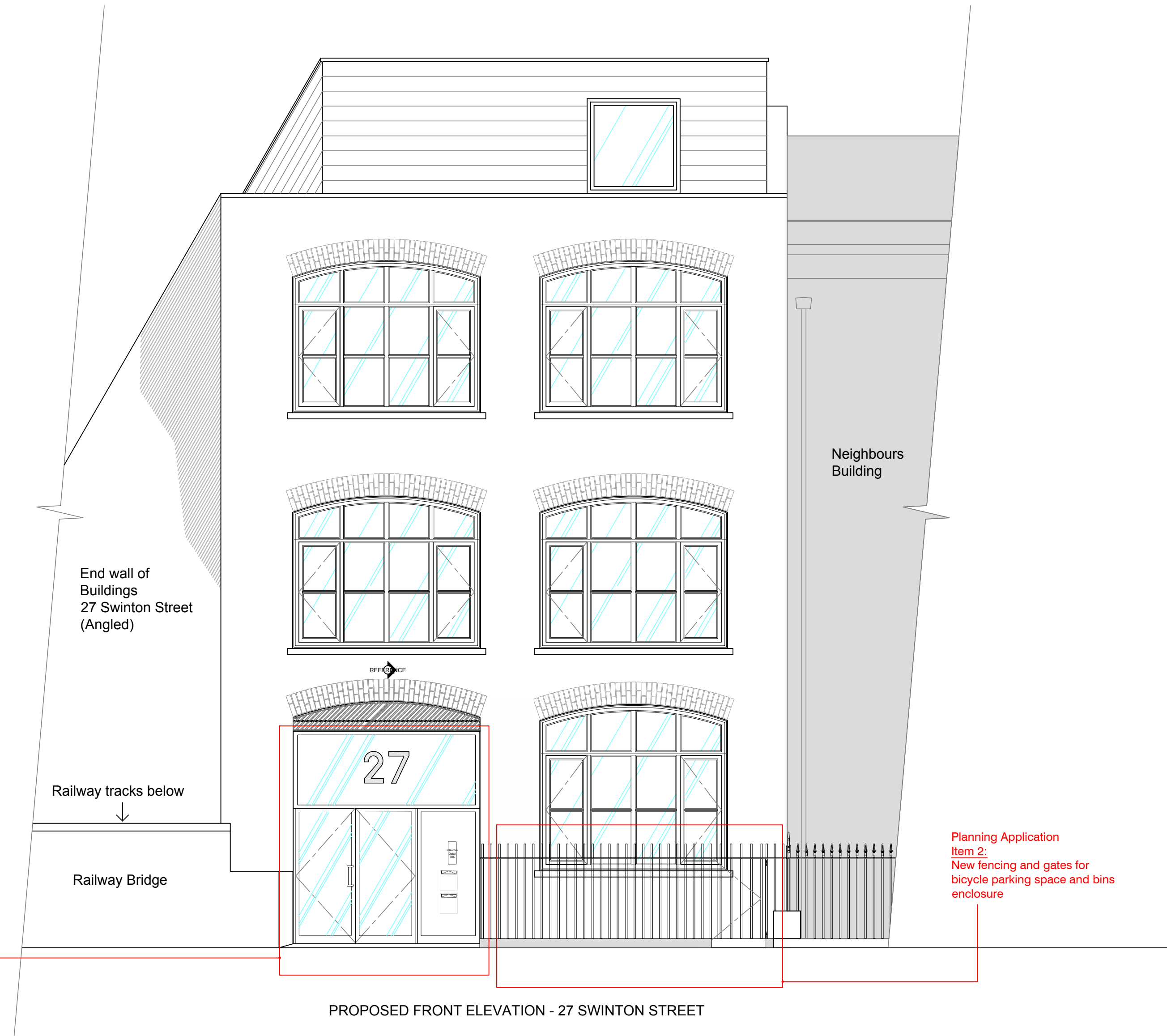
PROPOSED FRONT ELEVATION - 27 SWINTON STREET

Planning Application Item 1: Installation of a new entrance lobby enclosure Fully glazed lobby to be constructed in aluminium profiles with an applied paint finish -Colour: Graphite(TBC)