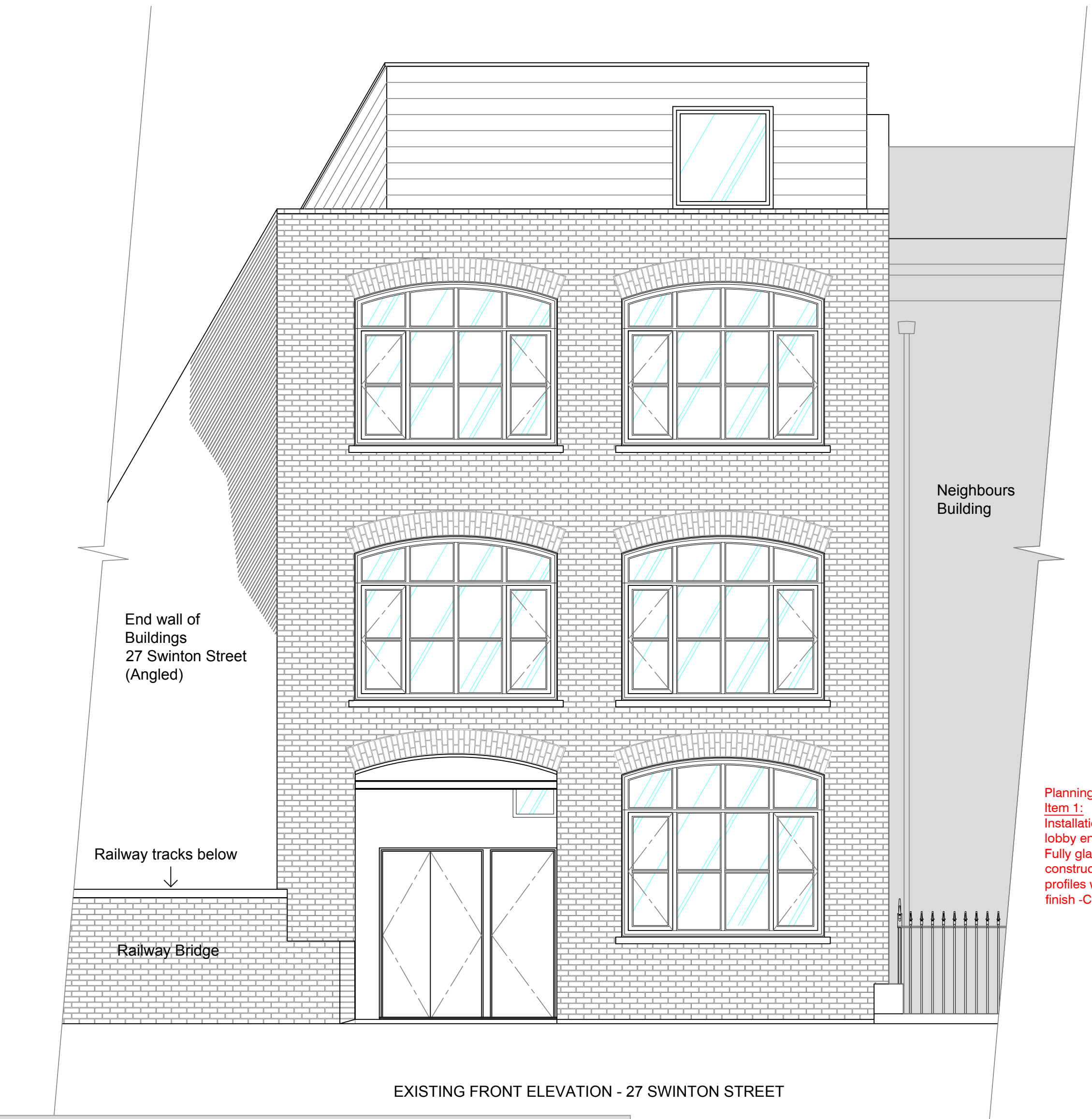
EXISTING FRONT ELEVATION - 27 SWINTON STREET

Planning Application Item 1: Installation of a new entrance lobby enclosure Fully glazed lobby to be constructed in aluminium profiles with an applied paint finish -Colour: Graphite(TBC)