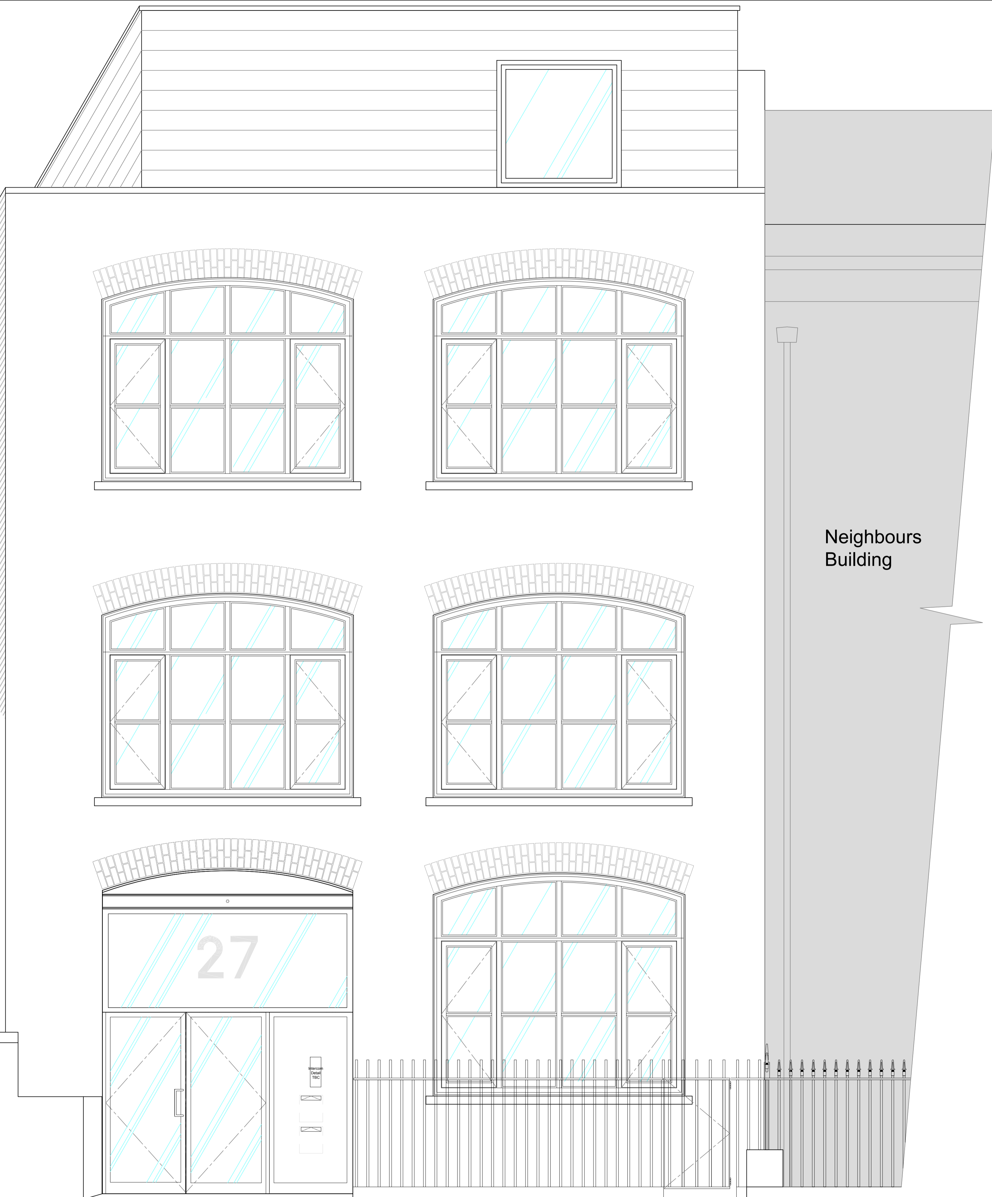
Proposed front of building Scale: 1/25