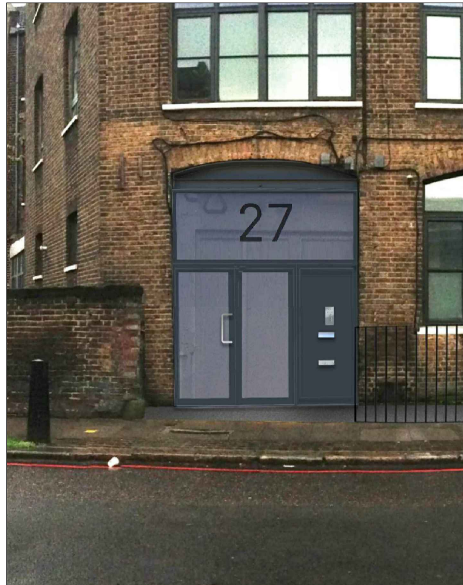
Proposed front of building Reference Only

End wall of Buildings 27 Swinton Street (Angled)