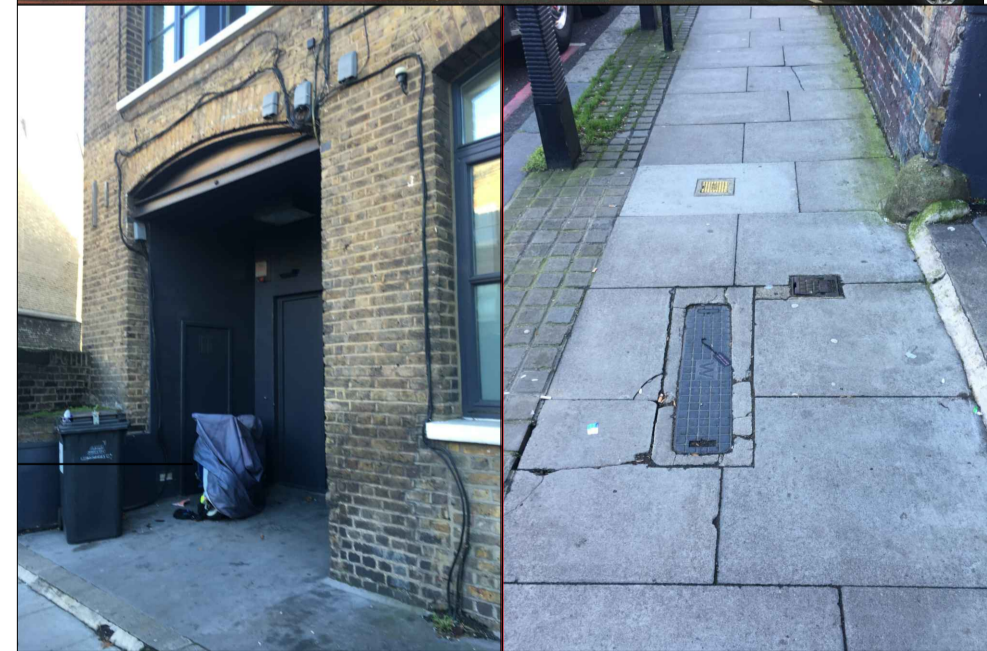
Existing Front of Building Photos