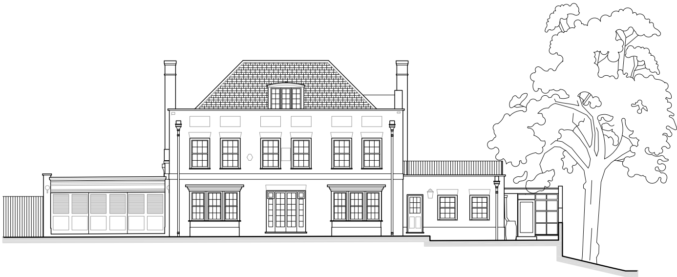
SOUTH ELEVATION 1 SCALE 1:200 @ A3 FRG-X-301