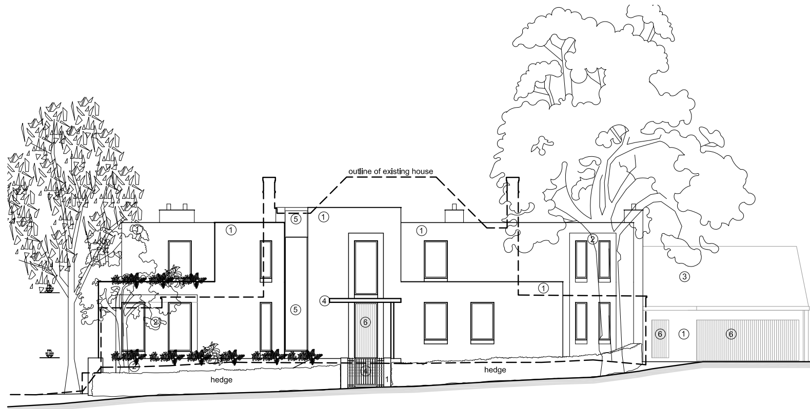
NORTH ELEVATION 1 SCALE 1:200 @ A3 FRG-P-300