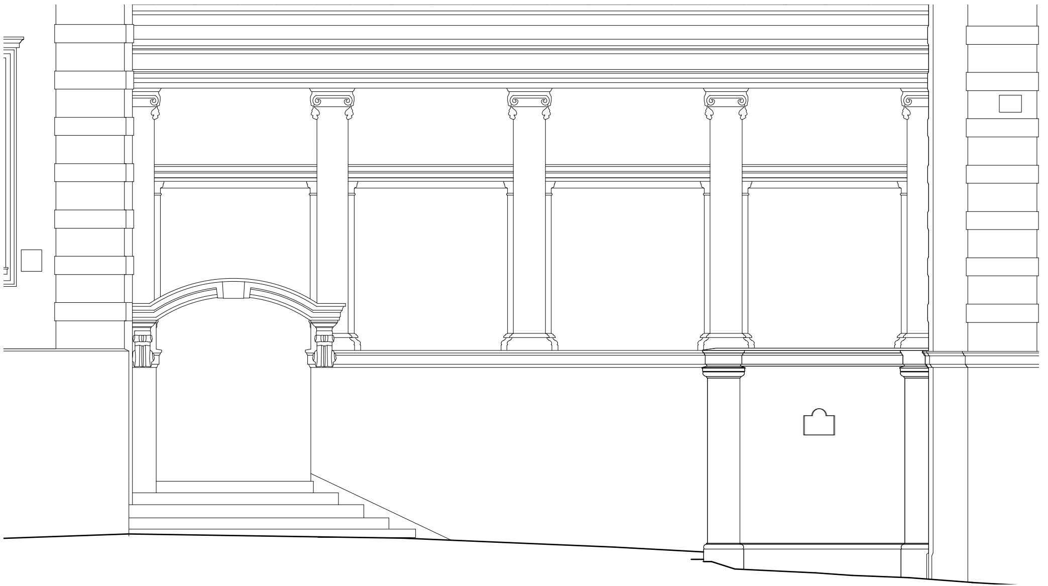
South Courtyard - Elevation of Cloister - Existing Scale 1:50