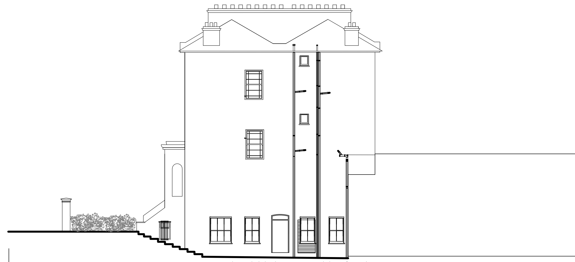
PROPOSED SIDE ELEVATION (FROM NO. 74)