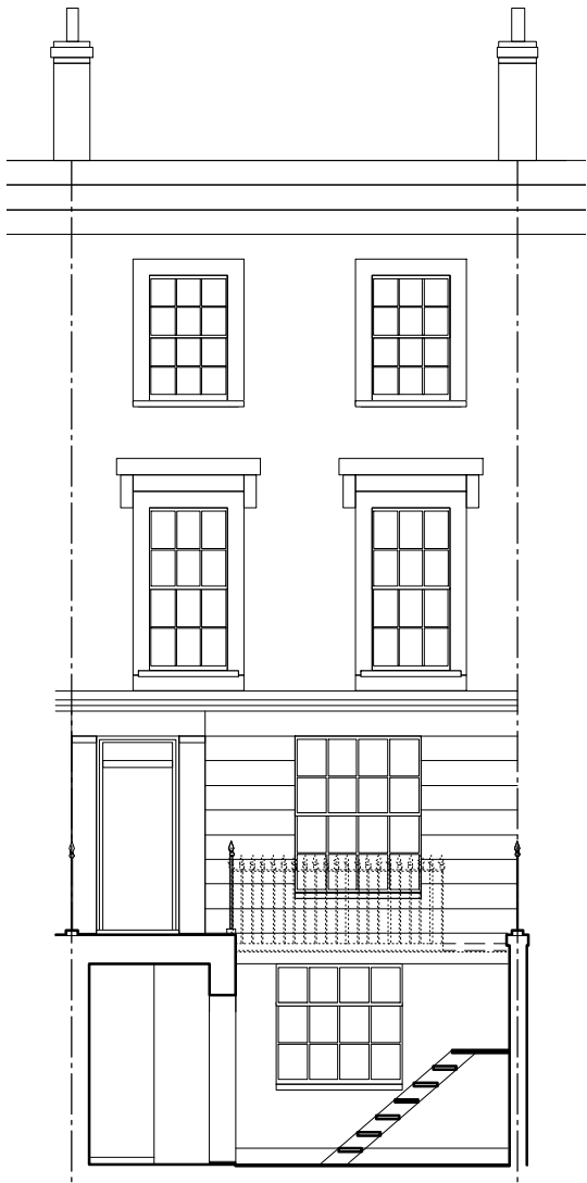
1 Existing Building Front Elevation Scale: 1:100