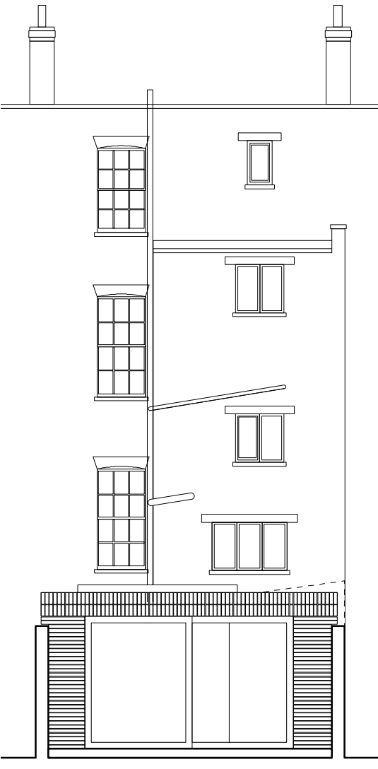
3 Existing Building Rear Elevation Scale: 1:100