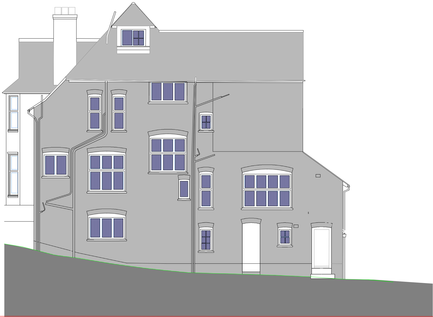
EXISTING SIDE WALL FACING No. 14 HOLLYCROFT AVENUE