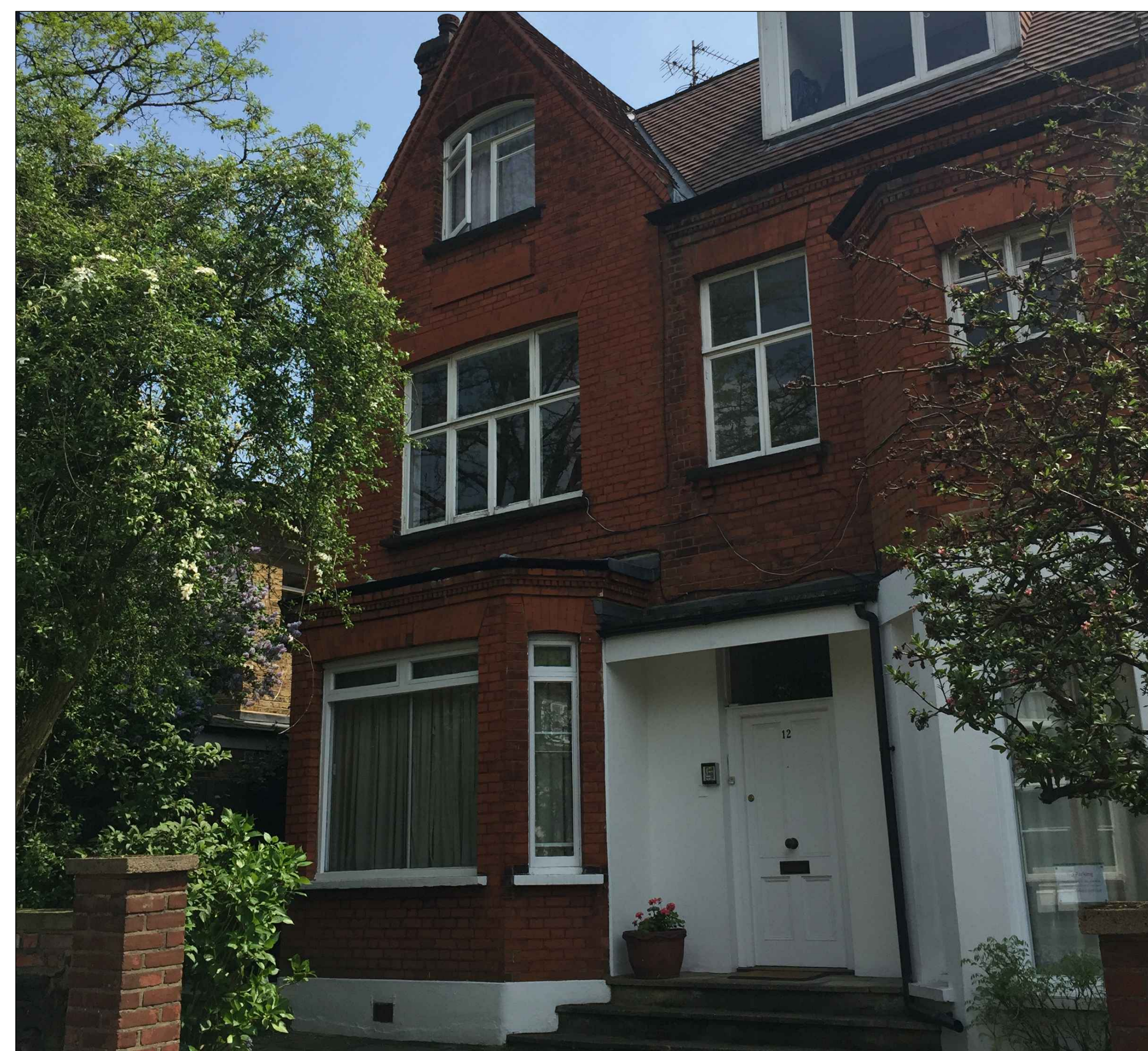
EXISTING PHOTO SCALE 1:NA@A3 LP-01