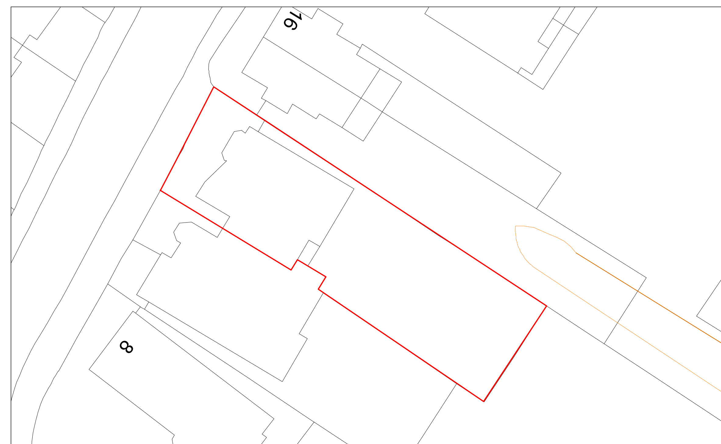
SITE PLAN SCALE 1:500@A3 LP-01 0m 10 20 30 40 50m