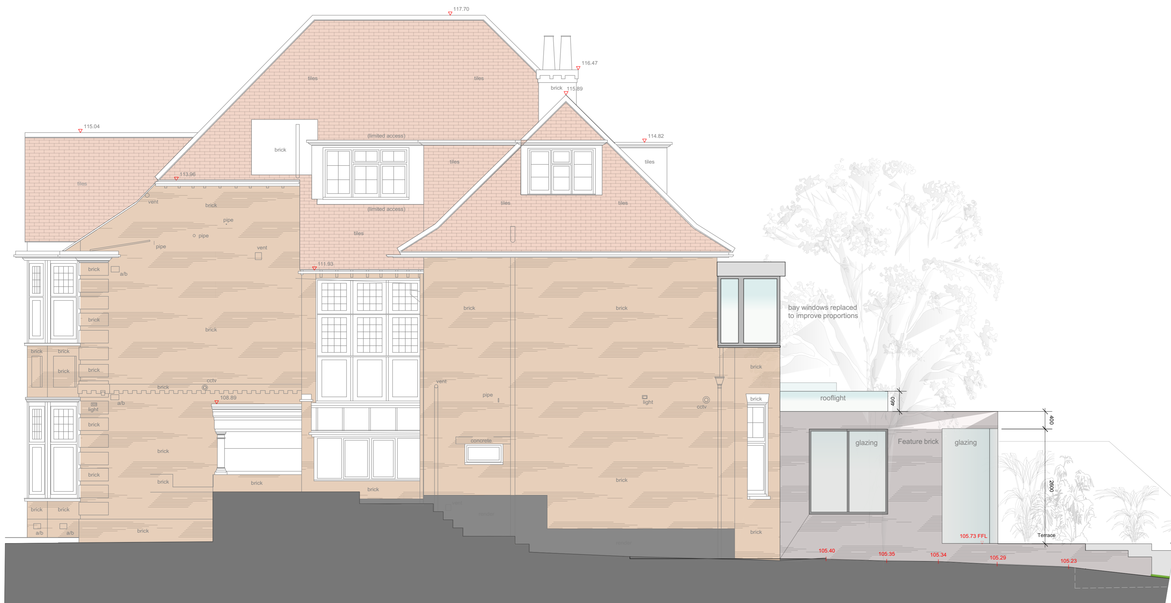
Proposed Side Elevation (segmented) 1:50