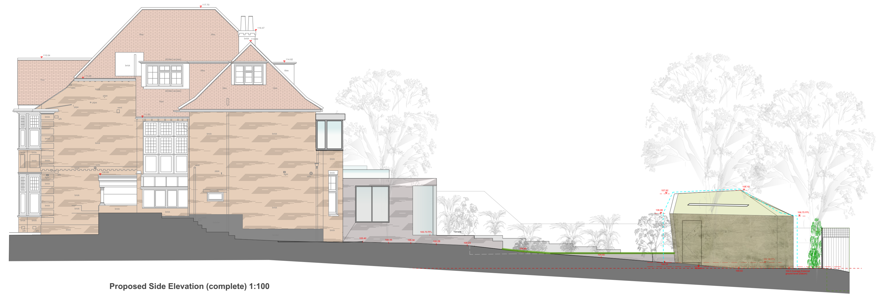
Proposed Side Elevation (complete) 1:100

REVISION A: studio revised / reduced in response to LPA consultation comments. Blue dashed line indicates previous proposal.