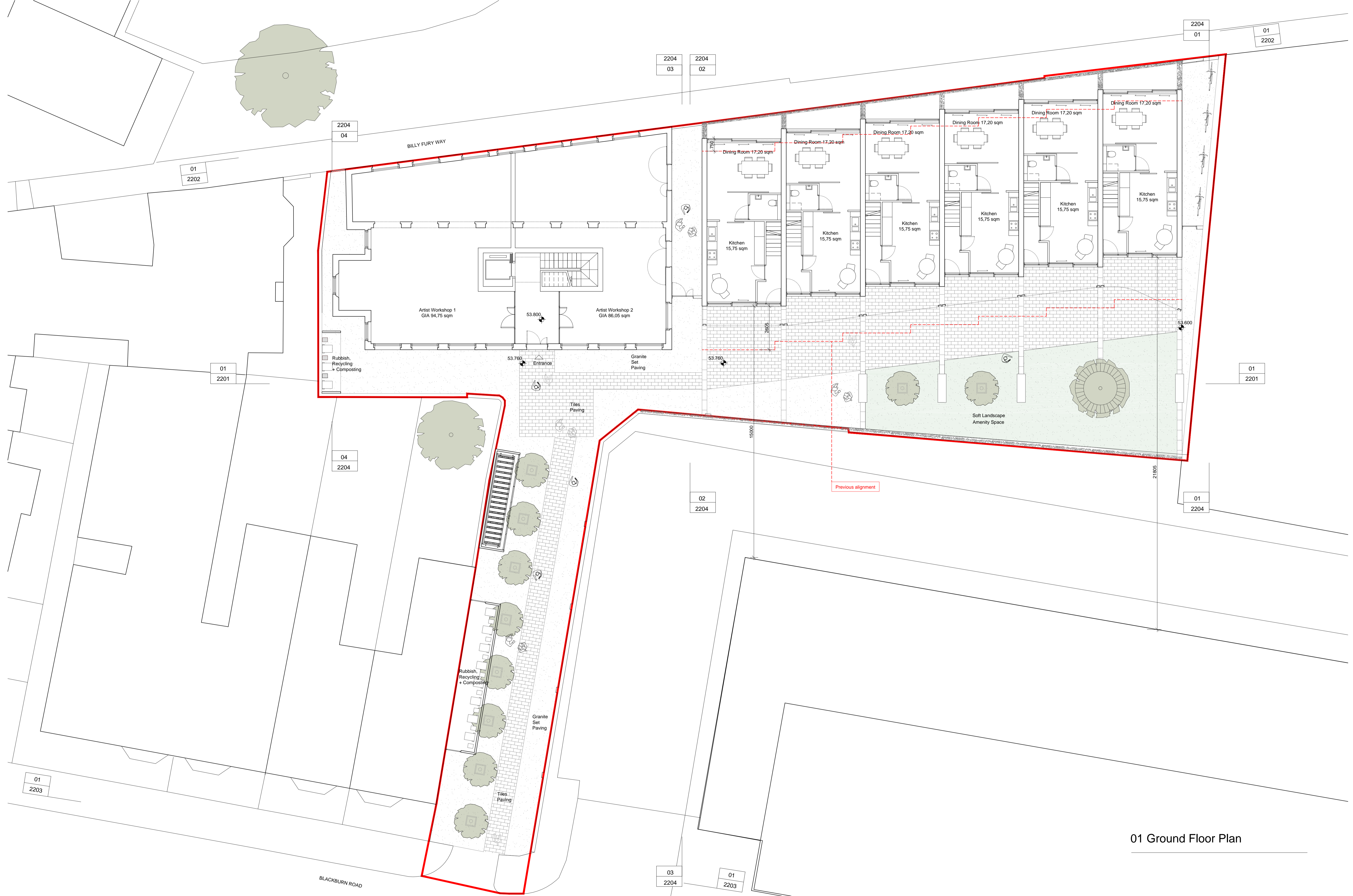
01 Ground Floor Plan

Horden Cherry Lee Architects Limited © 36-38 Berkeley Square London W1J 5AE T 020 7495 4119 F 020 7493 7162 E info@hcla.co.uk