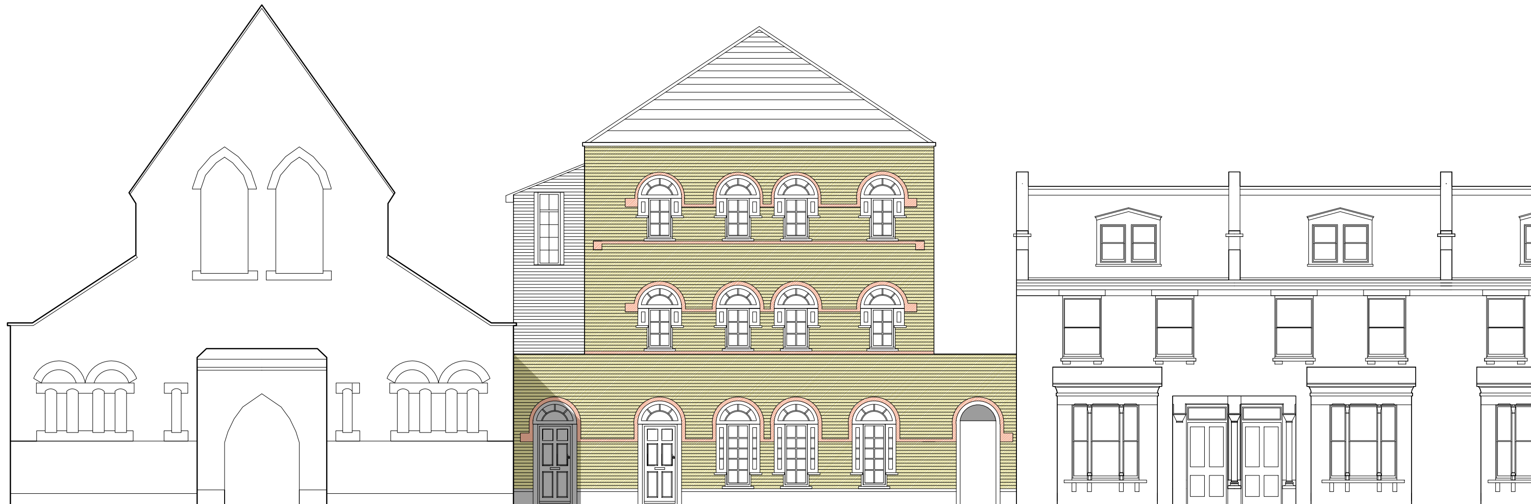
Front elevation existing