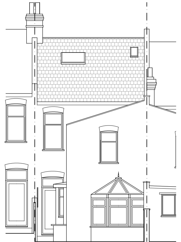
REAR ELEVATION (existing)