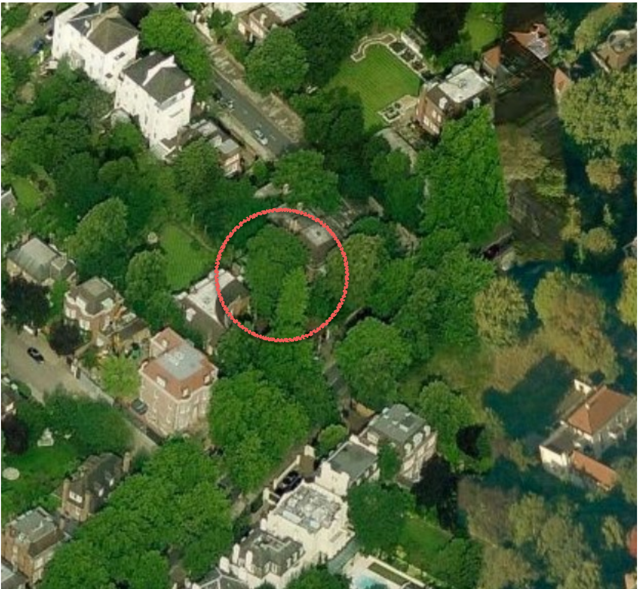
aerial view showing context and trees

No firm proposal can be developed until the principle of removal is established.