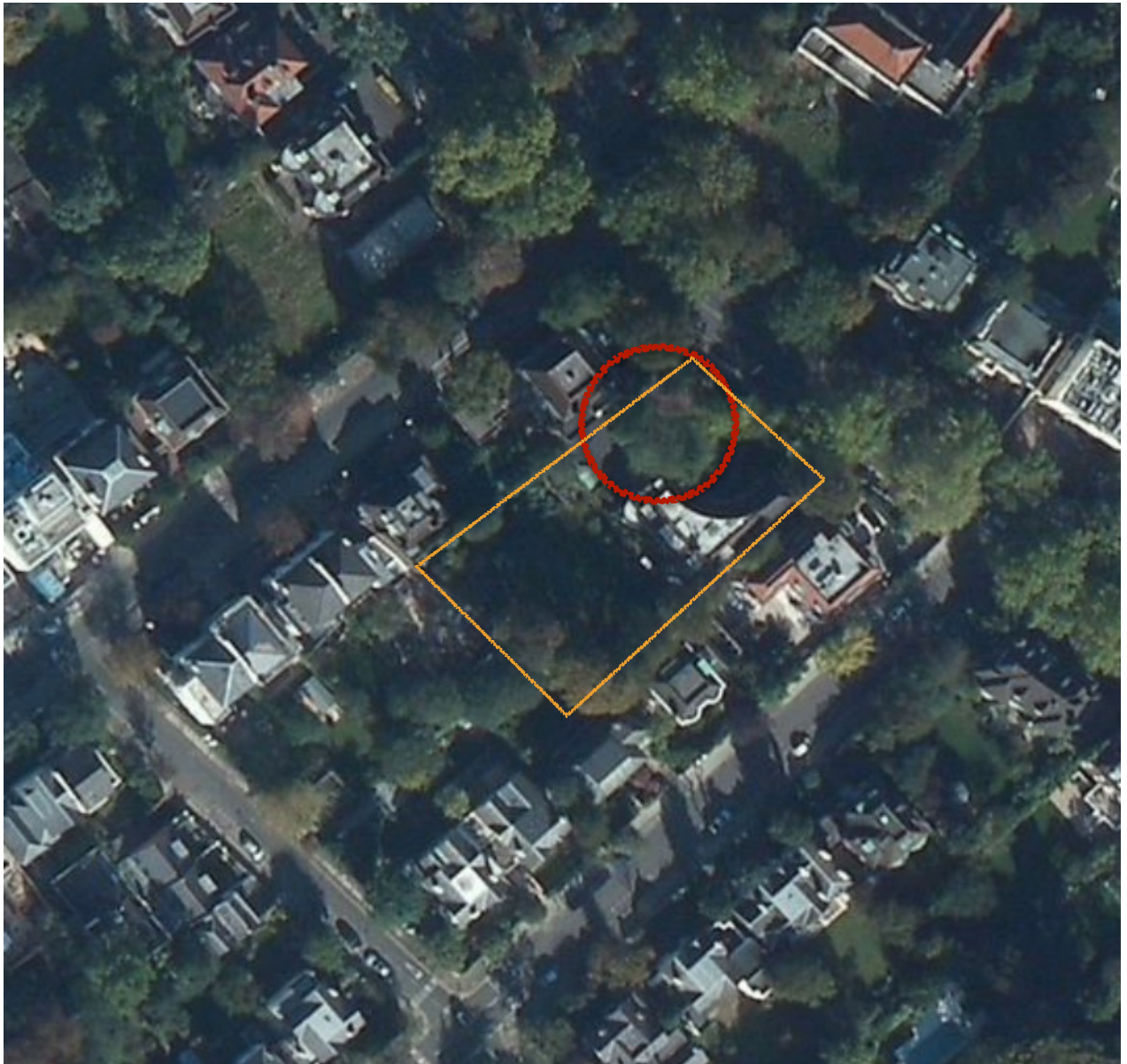
aerial view showing site and subject tree