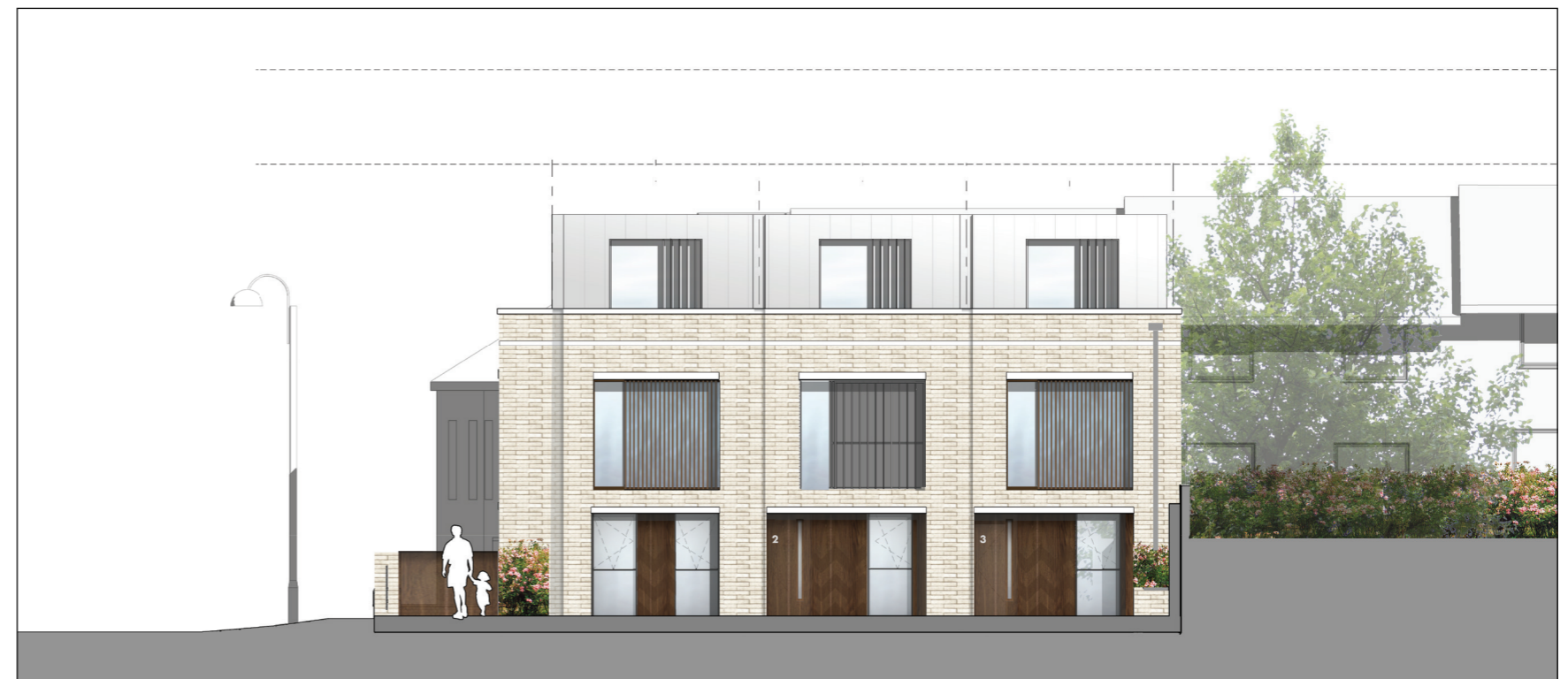
Proposed visually open elevation onto Sycamore Court creates a 'half square' and improves surveillance to the surroundings.