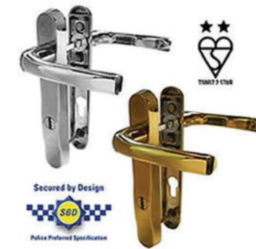
Secured by Design approved products