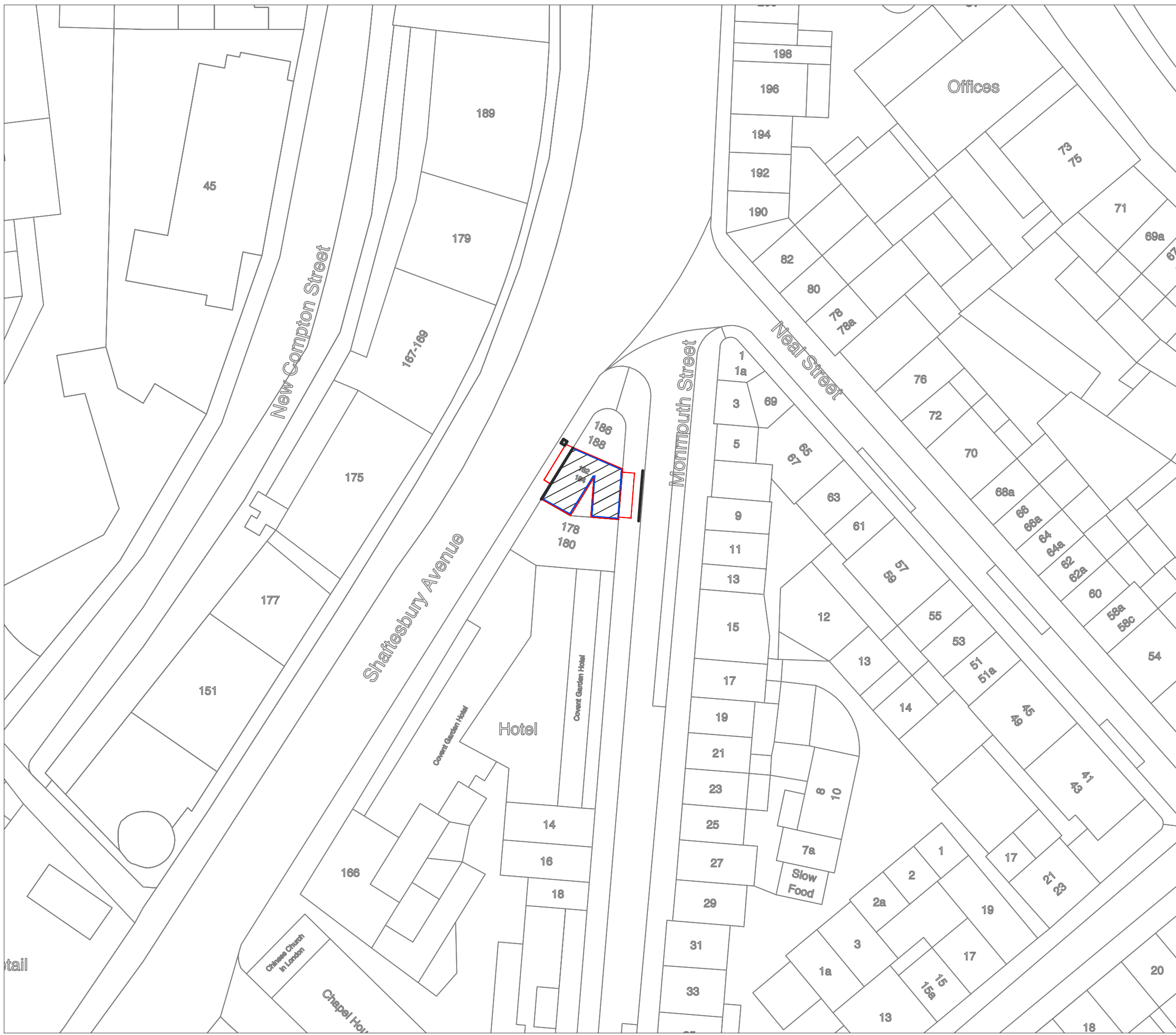
SITE LOCATION PLAN 1:500 @ A0 0 10 20 30 40