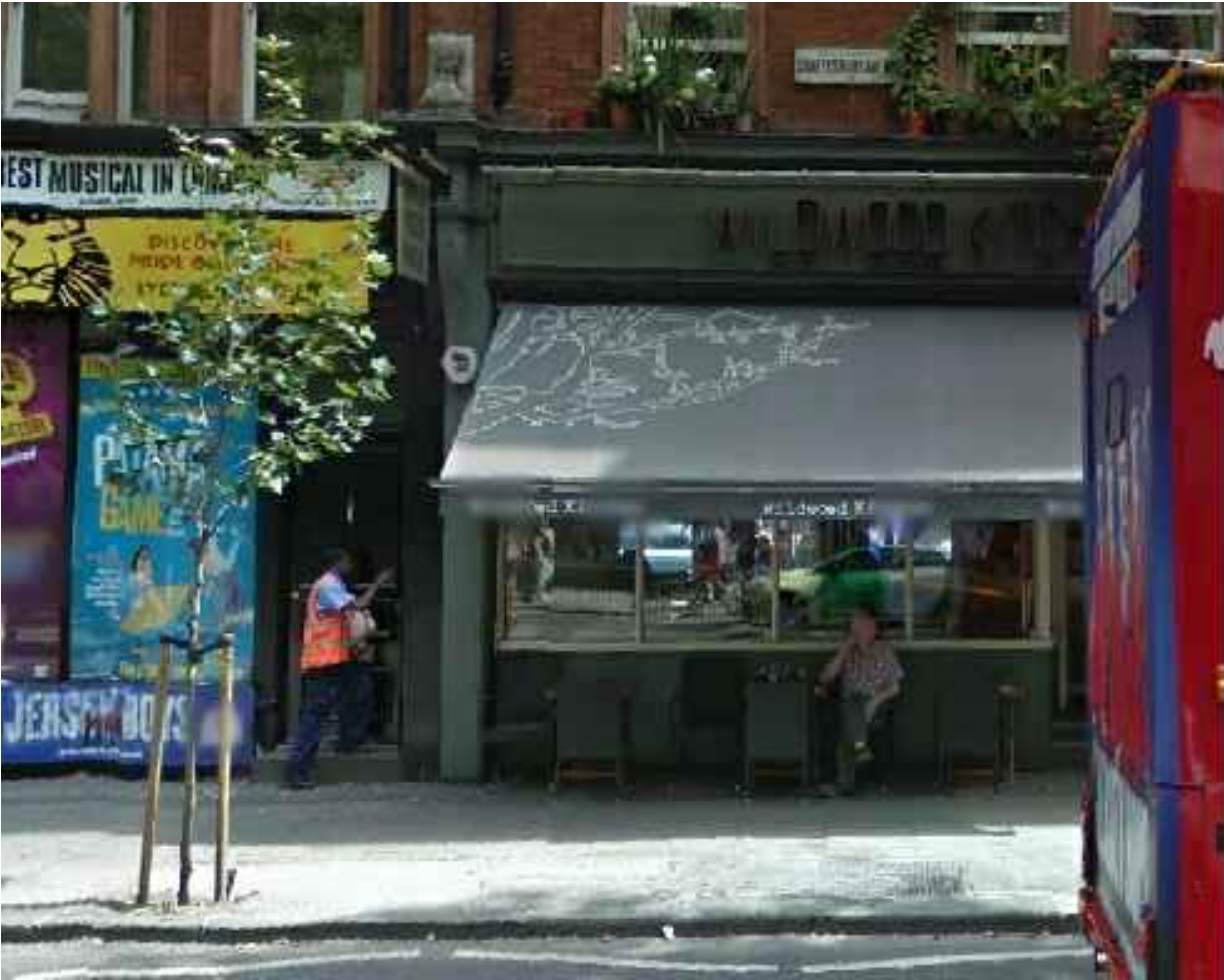
GOOGLE VIEW TREE TO LEFT SIDE OF WILDWOOD SITE