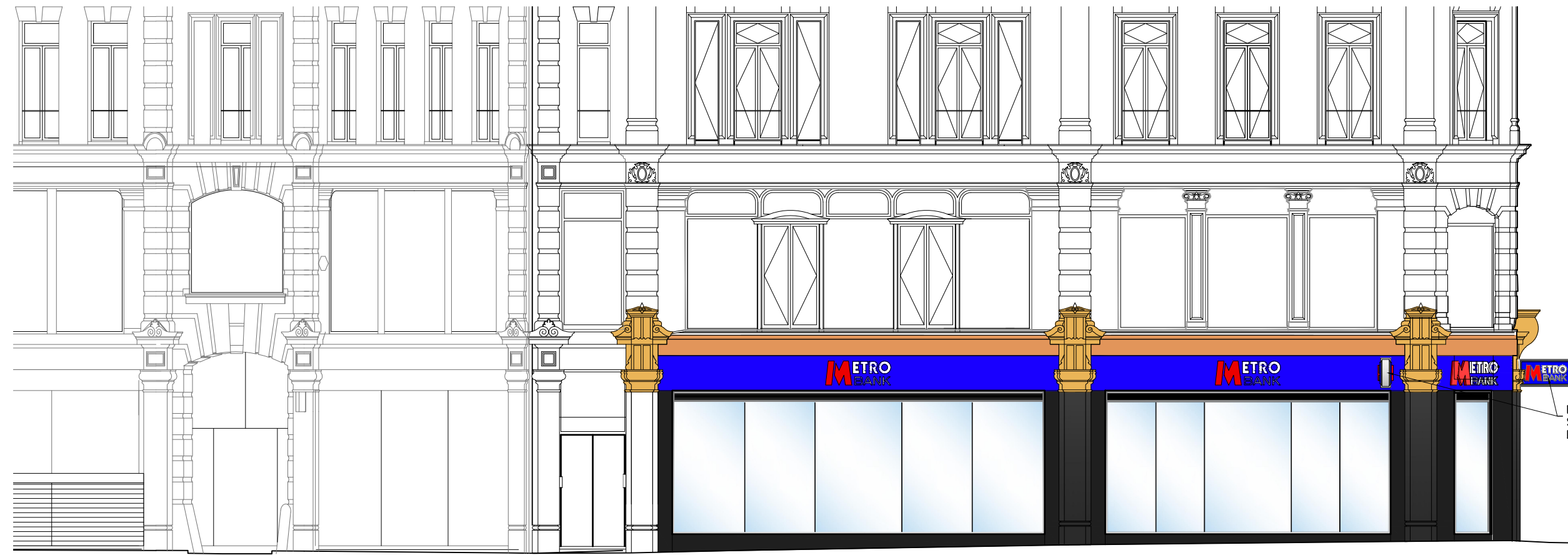
1 PROPOSED STORE STREET ELEVATION