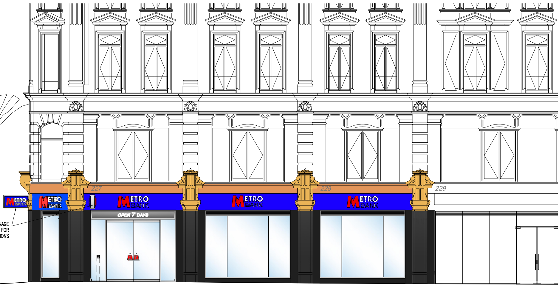
2 PROPOSED TOTTENHAM COURT ROAD ELEVATION