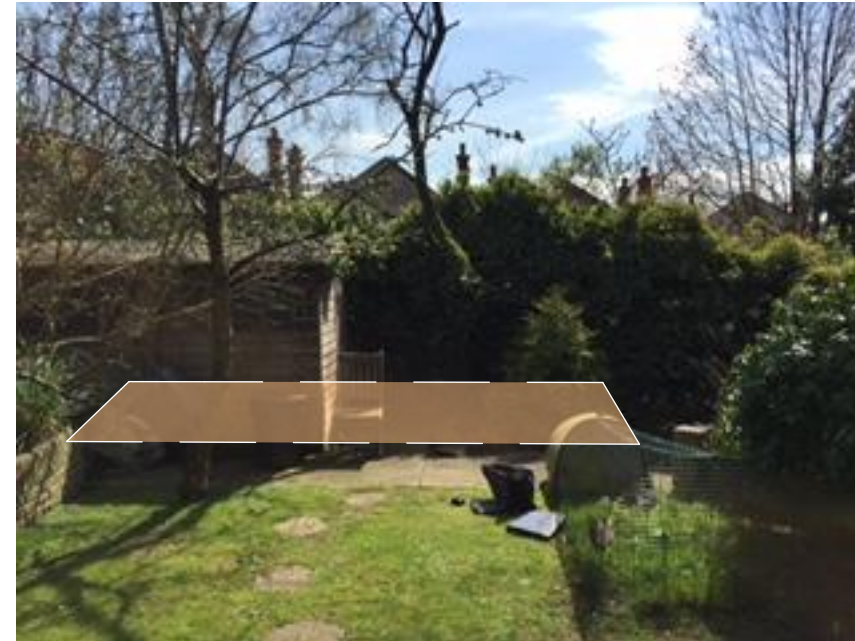
Site Images (Approximation of proposal's location shown with )