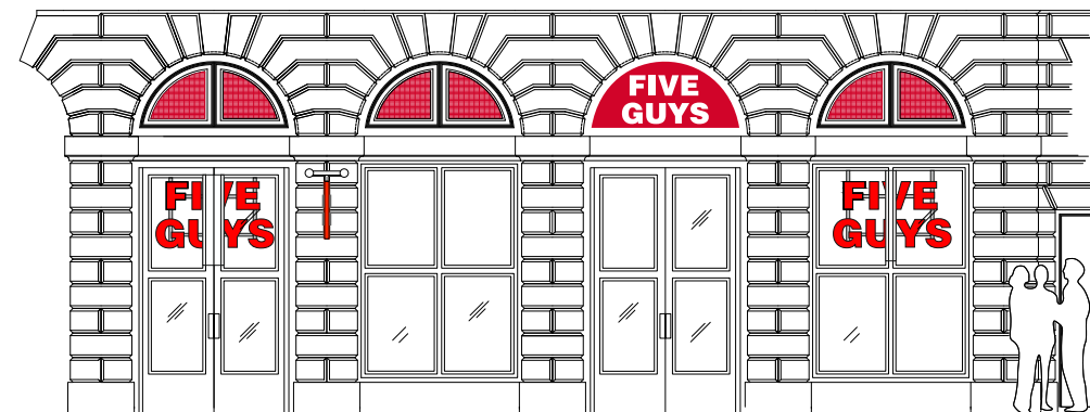
Proposed Elevation without café barriers or shop blinds Scale 1:100