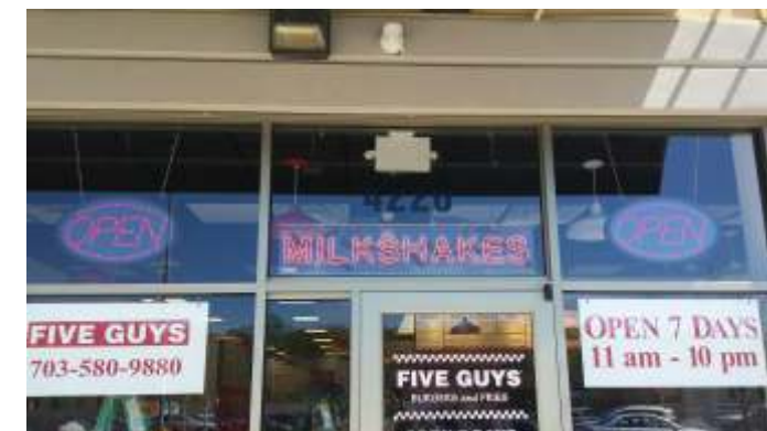
External Neon Milkshake Sign