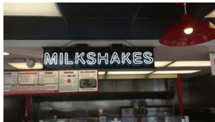
Internal Neon Milkshake Sign