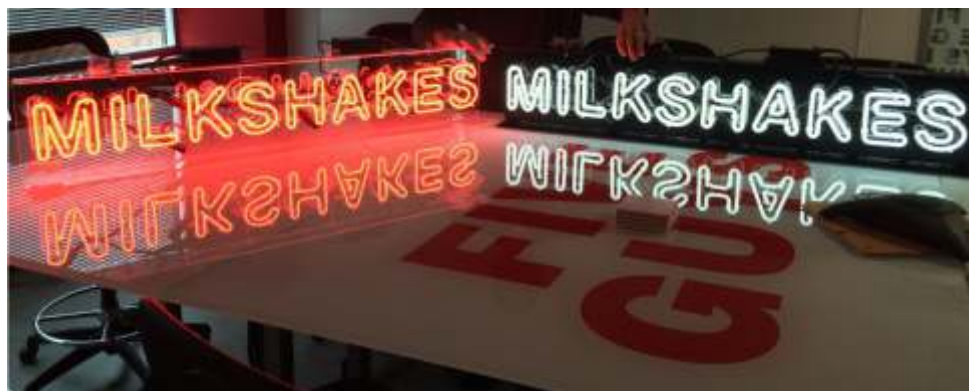
Typical American Neon Milkshake Sign