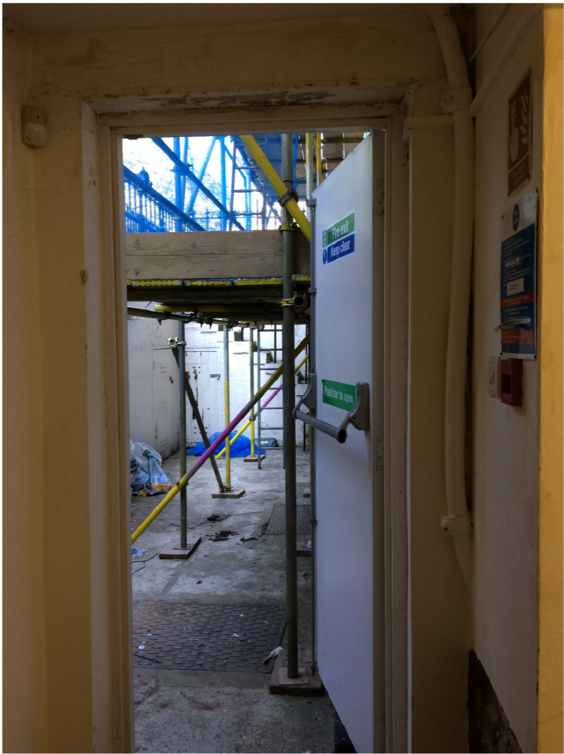
Photograph of existing flush door 47.DB.E11 to be replaced by door 47.DB.P01