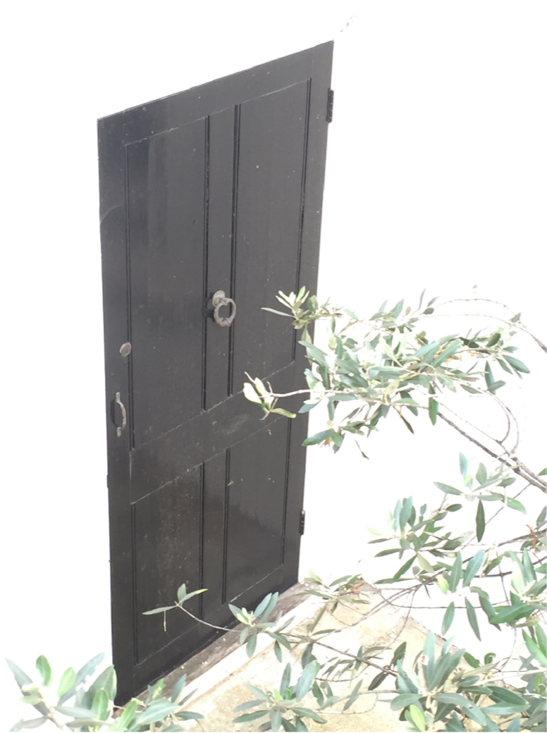
Photograph of existing panelled basement door to No. 49 - moulding to be copied