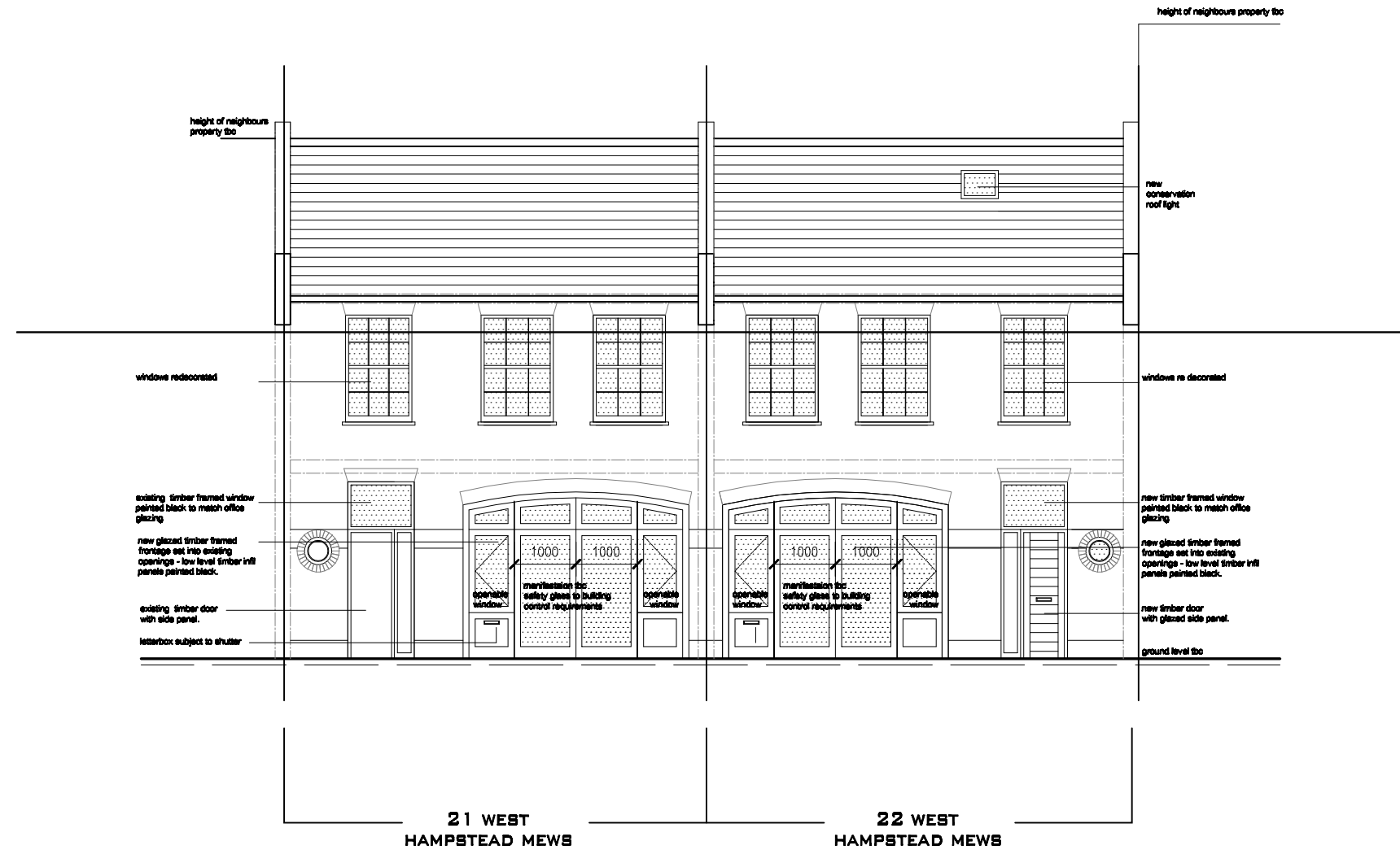
ELEVATION AS PER APPROVED PLANNING APPLICATION