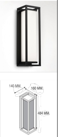
2 PHOTO: wall mounted lights SCALE N/A