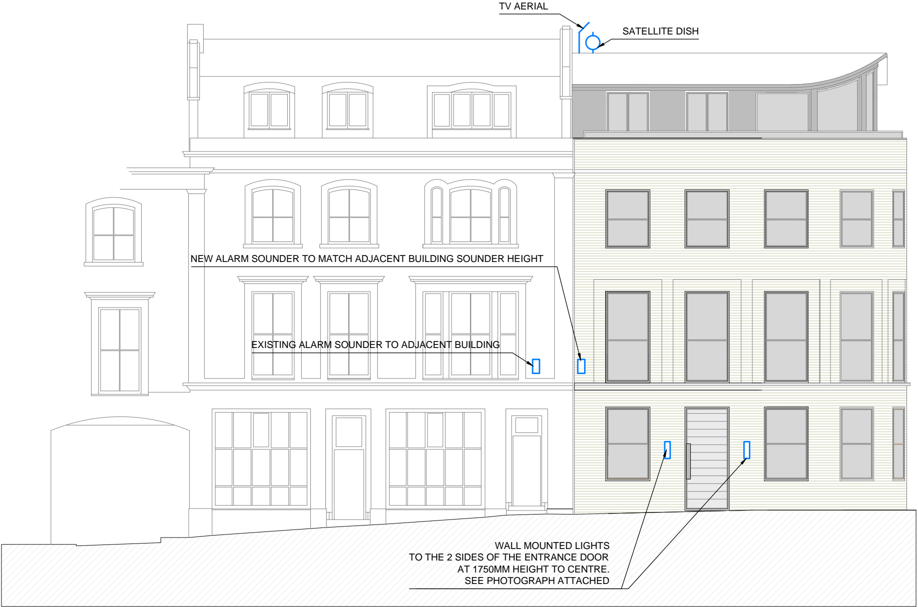
1 ELEVATION TO BELSIZE PLACE SCALE 1:100