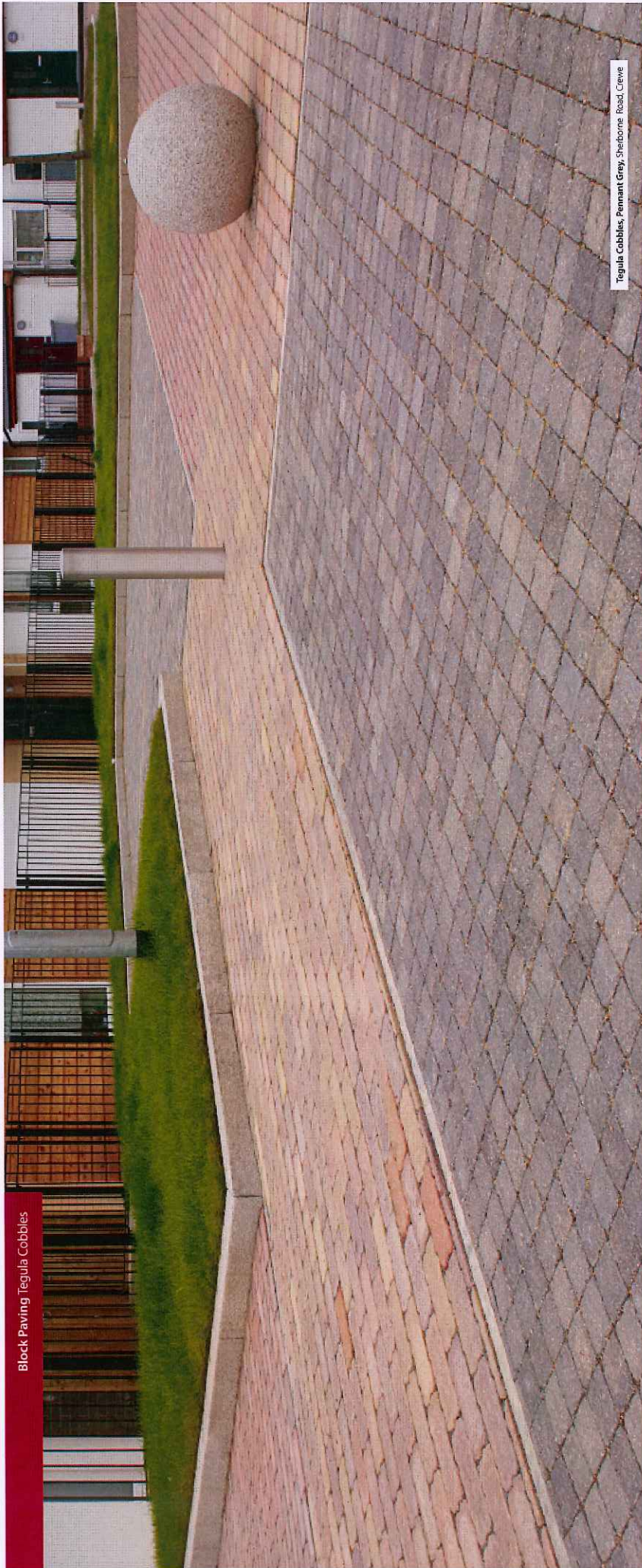
Tegula Cobbles, Pennant Grey, Sherborne Road, Crewe