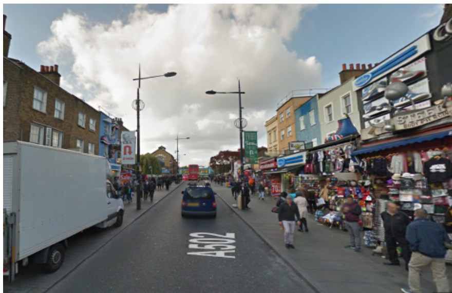
Views of the lamp posts adorned with banners going down to Camden Town Underground station