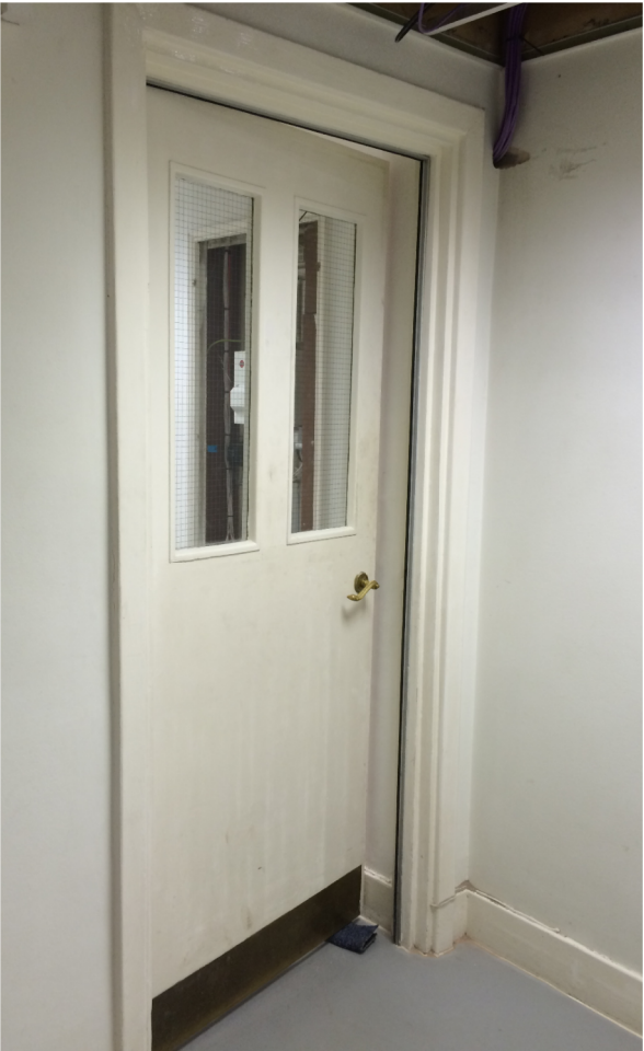
Photograph of existing flush door with vision panels 47.DB.E08

TYPE 4 47.DB.P02 & 47.DB.P03 Internal flush door with vision panel, to replace existing flush doors 47.DB.E08 & 47.DB.E12 New frame and architrave to match existing