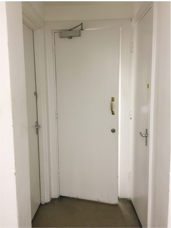
Photograph of existing flush door 47.DB.E12

Rev. 03 Revised HR 20.07.16 Rev 02 Revised HR 19.07.16 Rev 01 Issued for tender vh 27.06.16