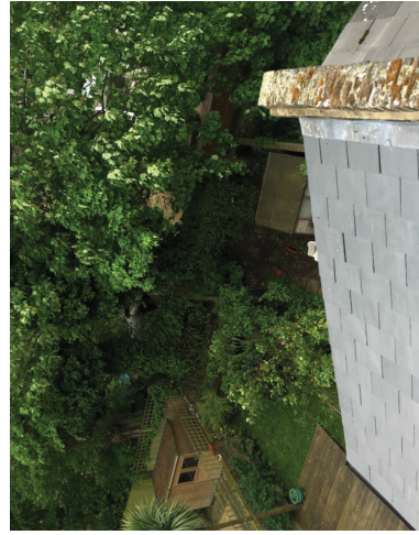
View from top of roof towards 59 Ground floor Flat garden