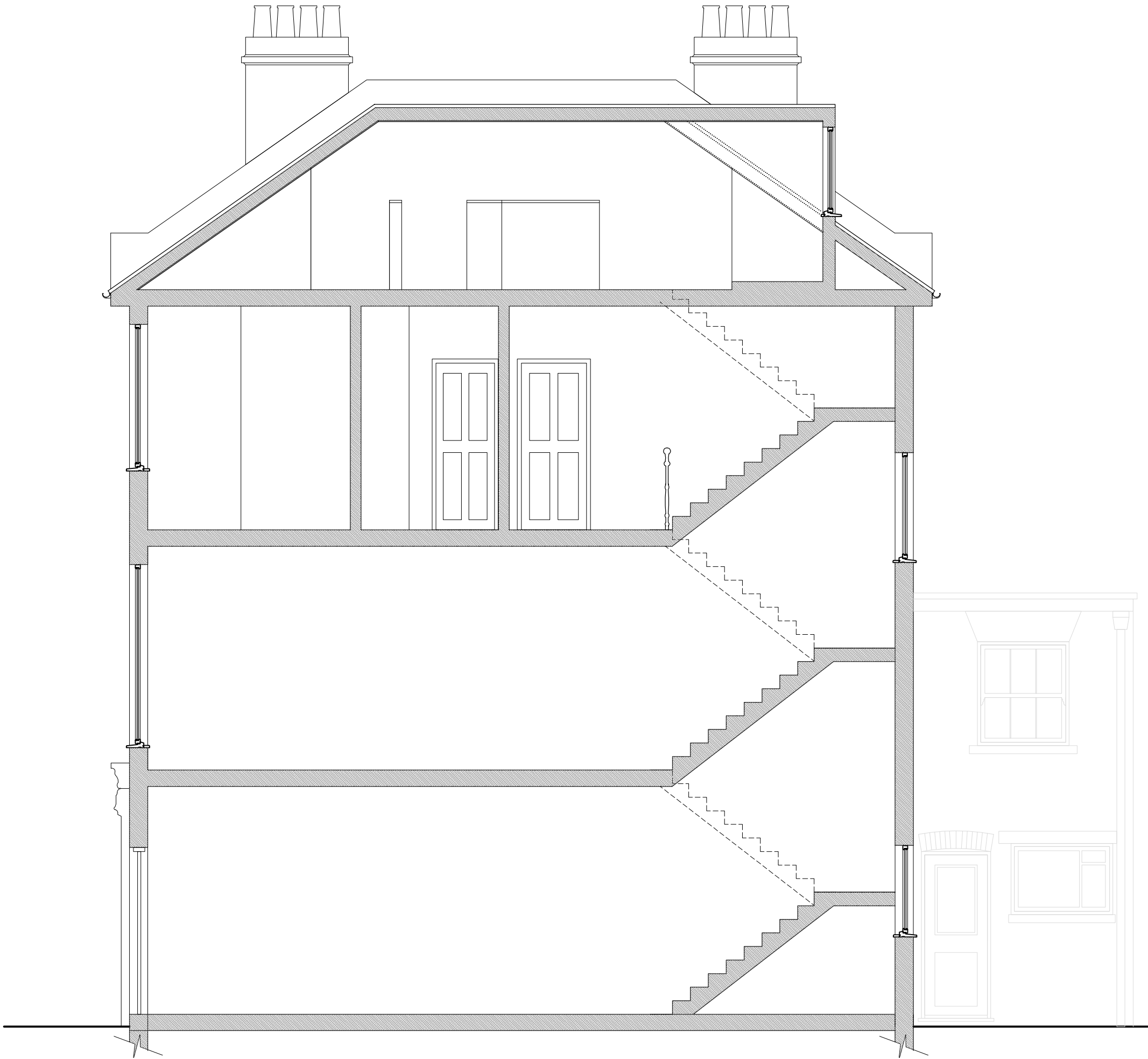
4A EXISTING SECTION A-A