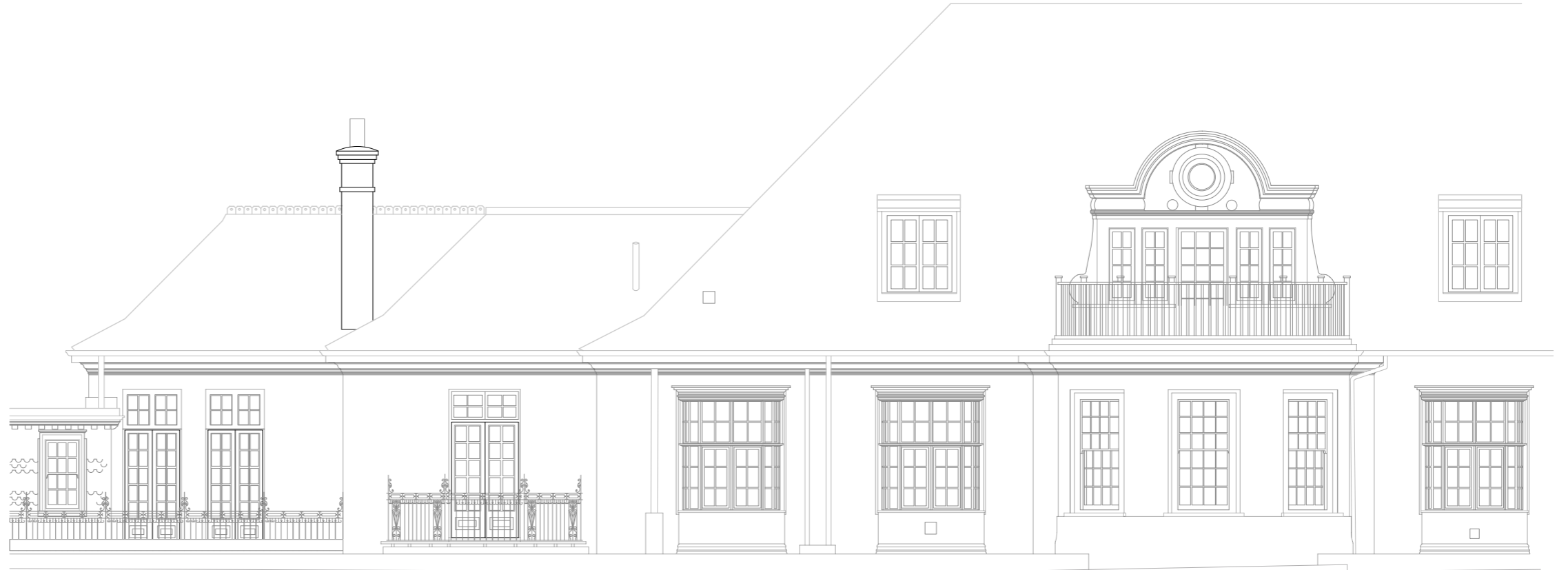
PROPOSED TERRACE 1 BALUSTRADE ELEVATION NORTH WEST WEST