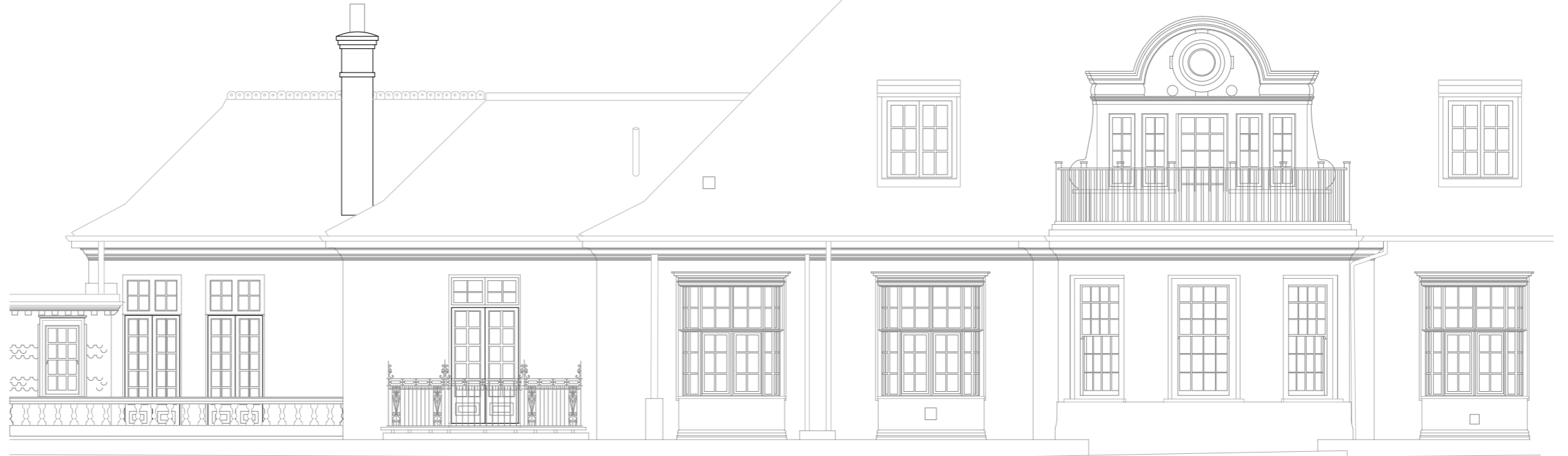
EXISTING TERRACE 1 BALUSTRADE ELEVATION NORTH WEST WEST