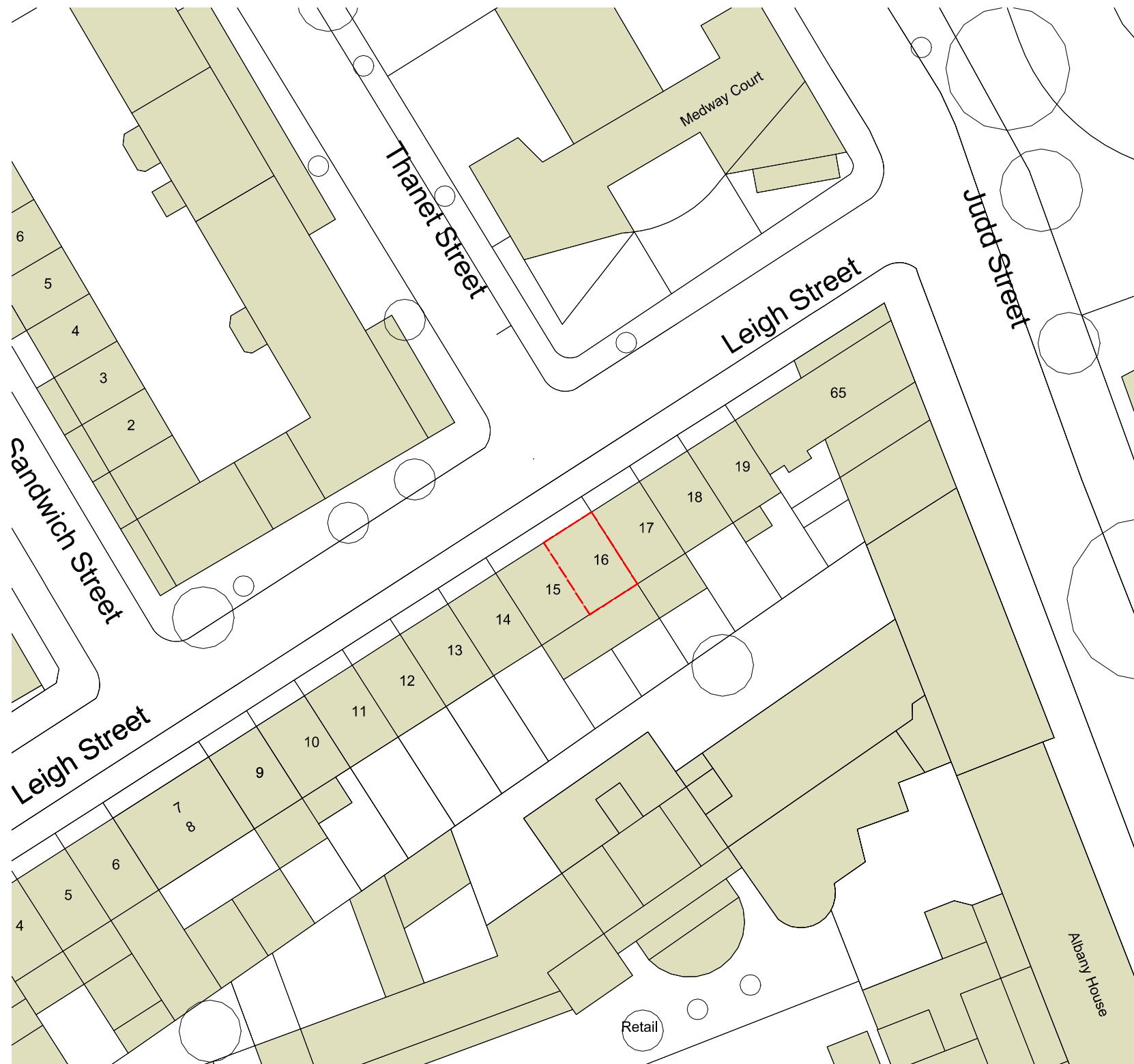
1 Existing Block Plan 1:500