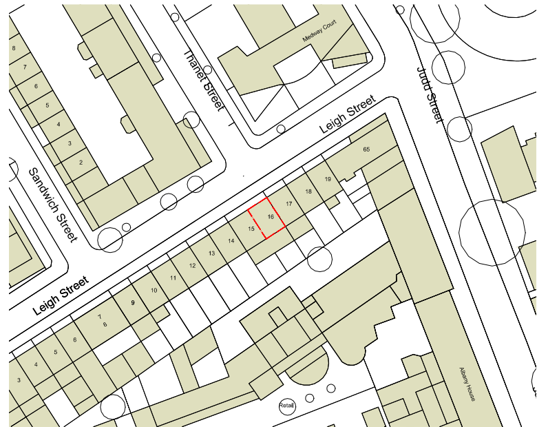
1 Site Location Plan 1:1250