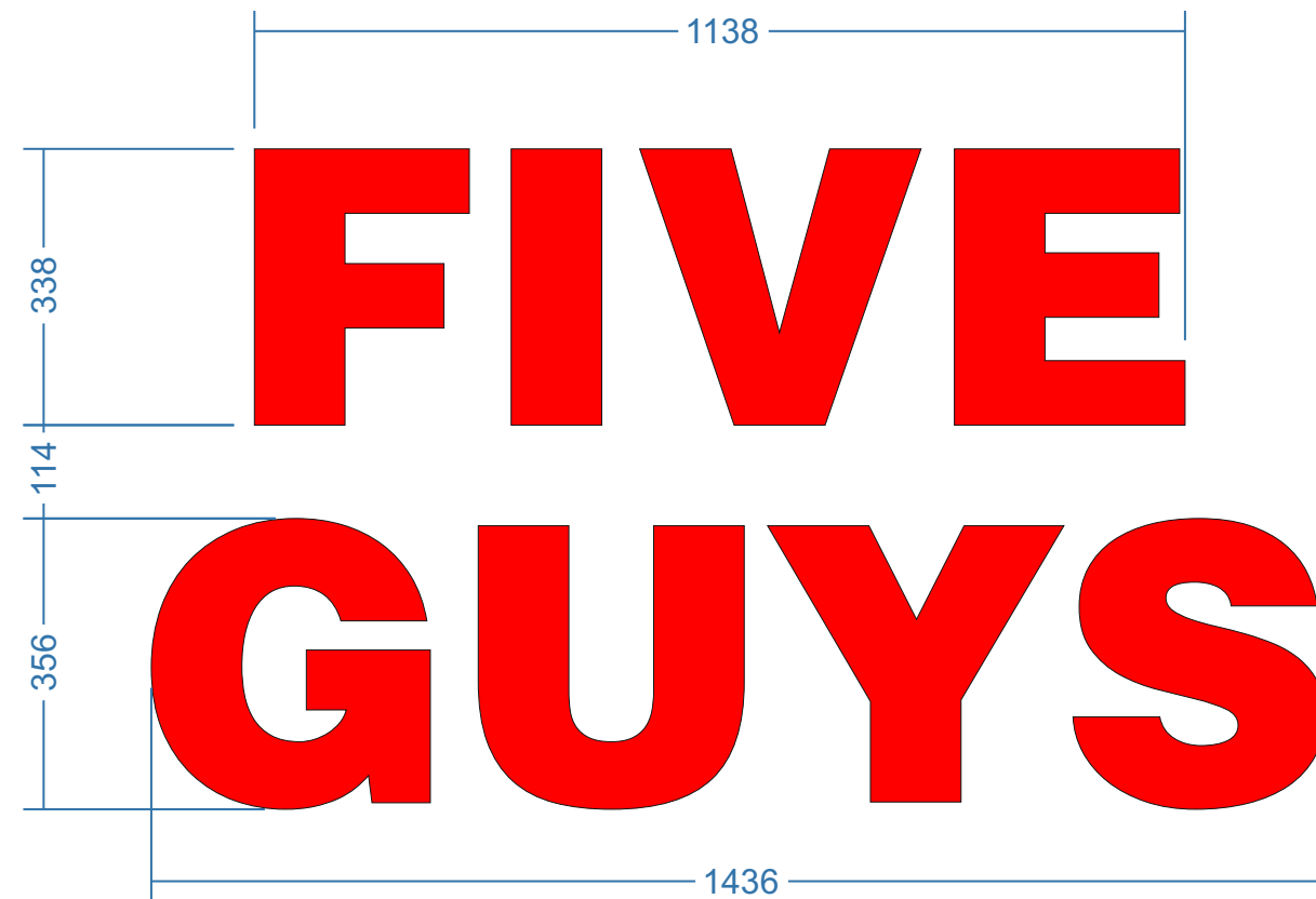
Five Guys Letters Scale 1:10