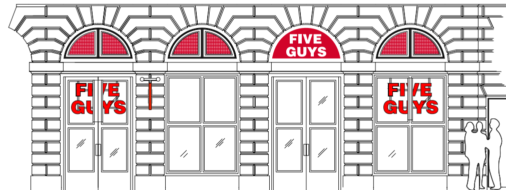
Proposed Elevation without café barriers or shop blinds Scale 1:100