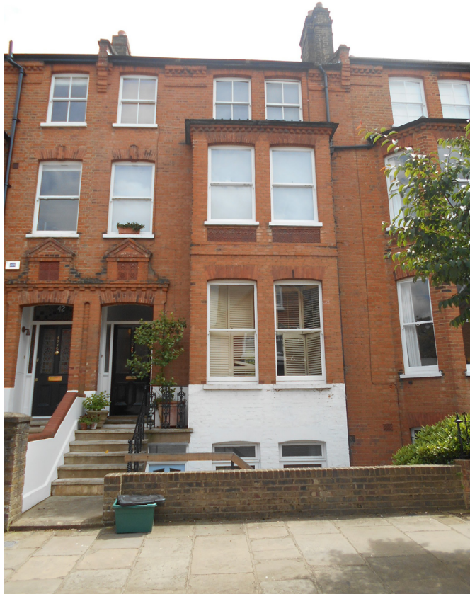
Front facade of n° 40