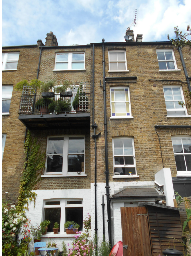
Rear facade of n° 40