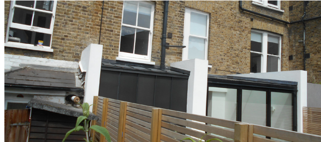
Existing rear extensions at n° 42, adjacent property