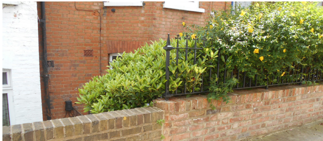
Front railings of neighbouring property