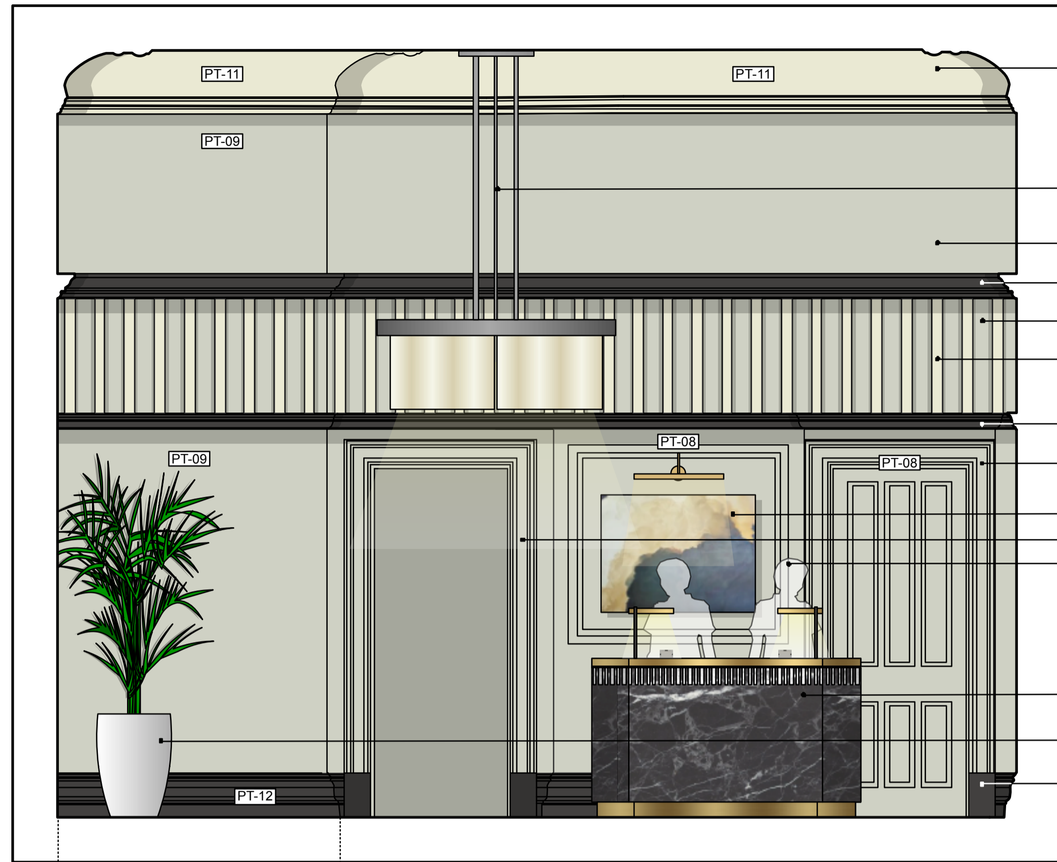
1 SECTION SE-06 Scale: 1:25

EXISTING CORNICE TO BE RETAINED AND MADE GOOD READY TO RECEIVE NEW PAINT FINISH WHERE INDICATED. NEW CORNICE FORMED TO MATCH, REFER TO PLAN