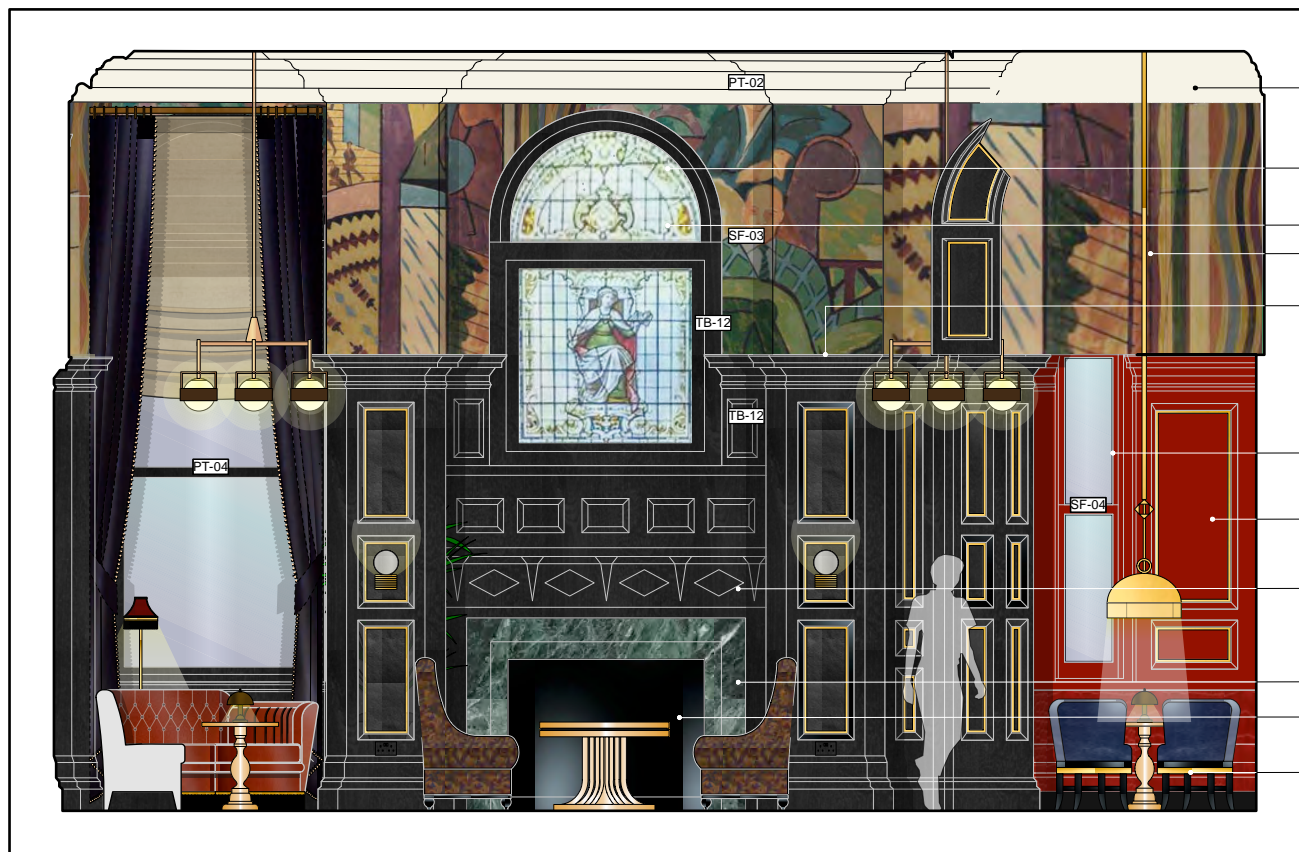
2 SECTION SE-04 Scale: 1:25