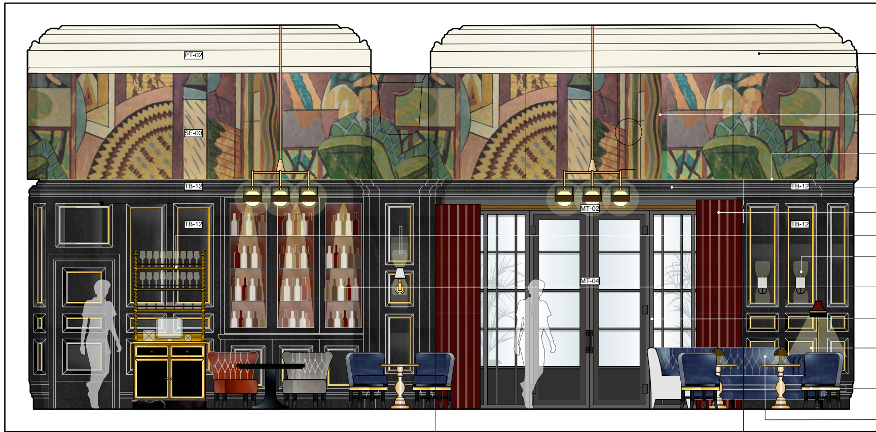
1 SECTION SE-04 Scale: 1:25

GENERAL NOTES: ALL DIMENSIONS TO BE CHECKED ON SITE AND ANY DISCREPANCIES TO BE REPORTED TO RSS ALL FINISHES, SAMPLES AND MOCK UPS TO BE APPROVED BY RSS PRIOR TO MANUFACTURE FOR DOOR, IRONMONGERY, SANITARYWARE AND LIGHTING REFER TO RSS SPECIFICATION INDEX FOR FURTHER INFORMATION FOR FINISHES REFER TO FINISHES SCHEDULE REFER TO RSS FF&E SCHEDULE FOR ITEMS PROCURED BY RSS