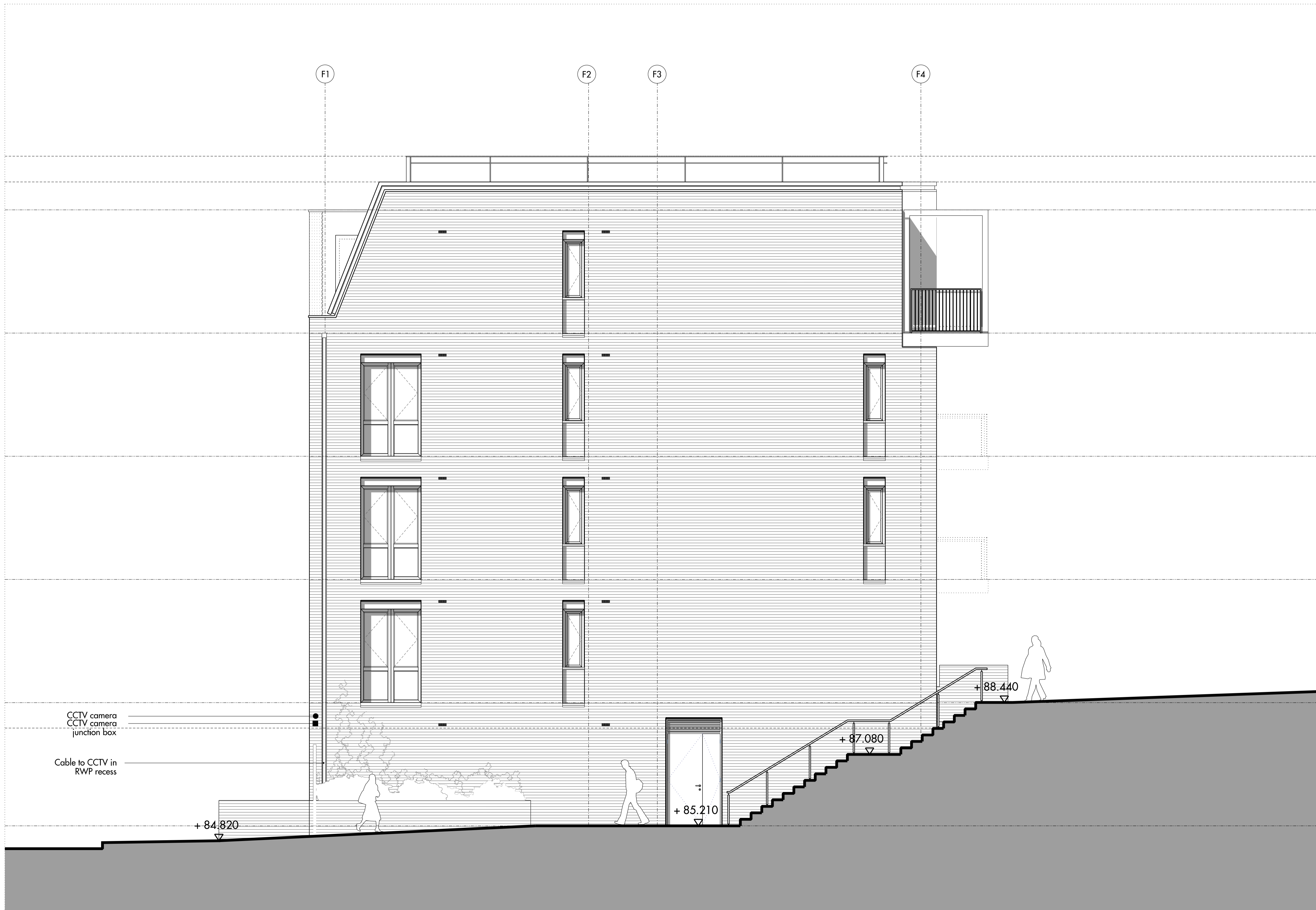
01 BLOCK F / ELEVATION - SOUTH EAST