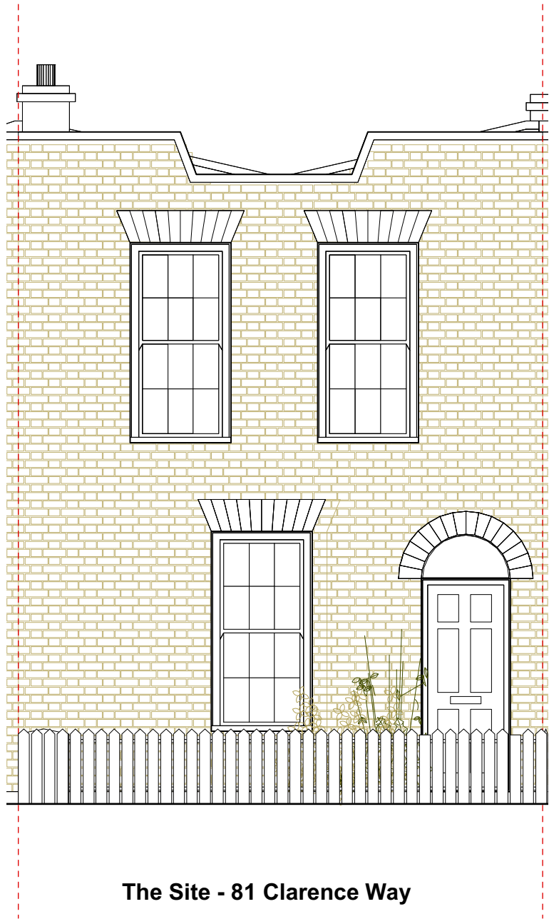
The Site - 81 Clarence Way FRONT ELEVATION [unaffected by proposal]