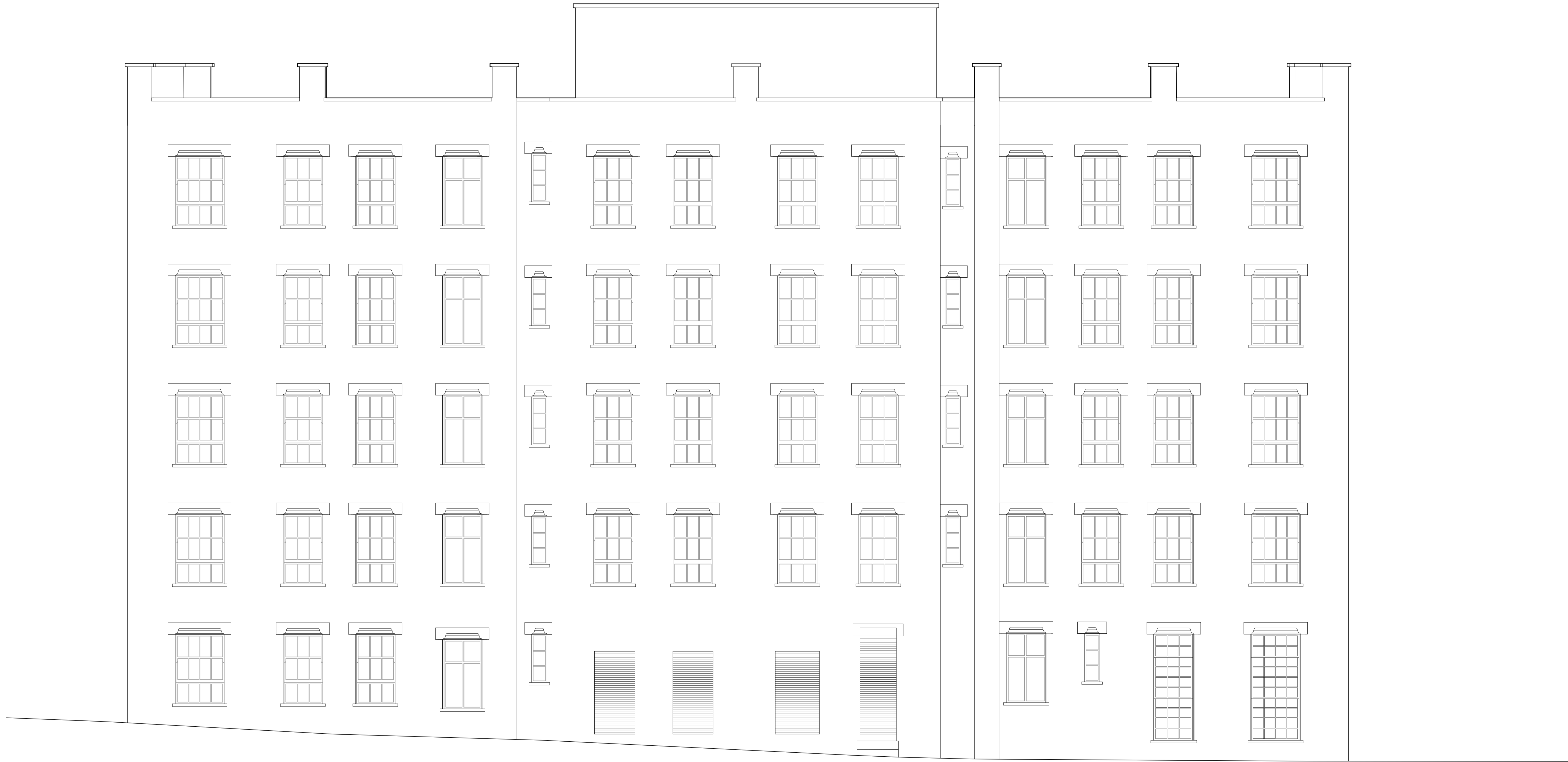
4 Existing North Elevation Scale: 1:50 @ A1 / 1:100 @ A3