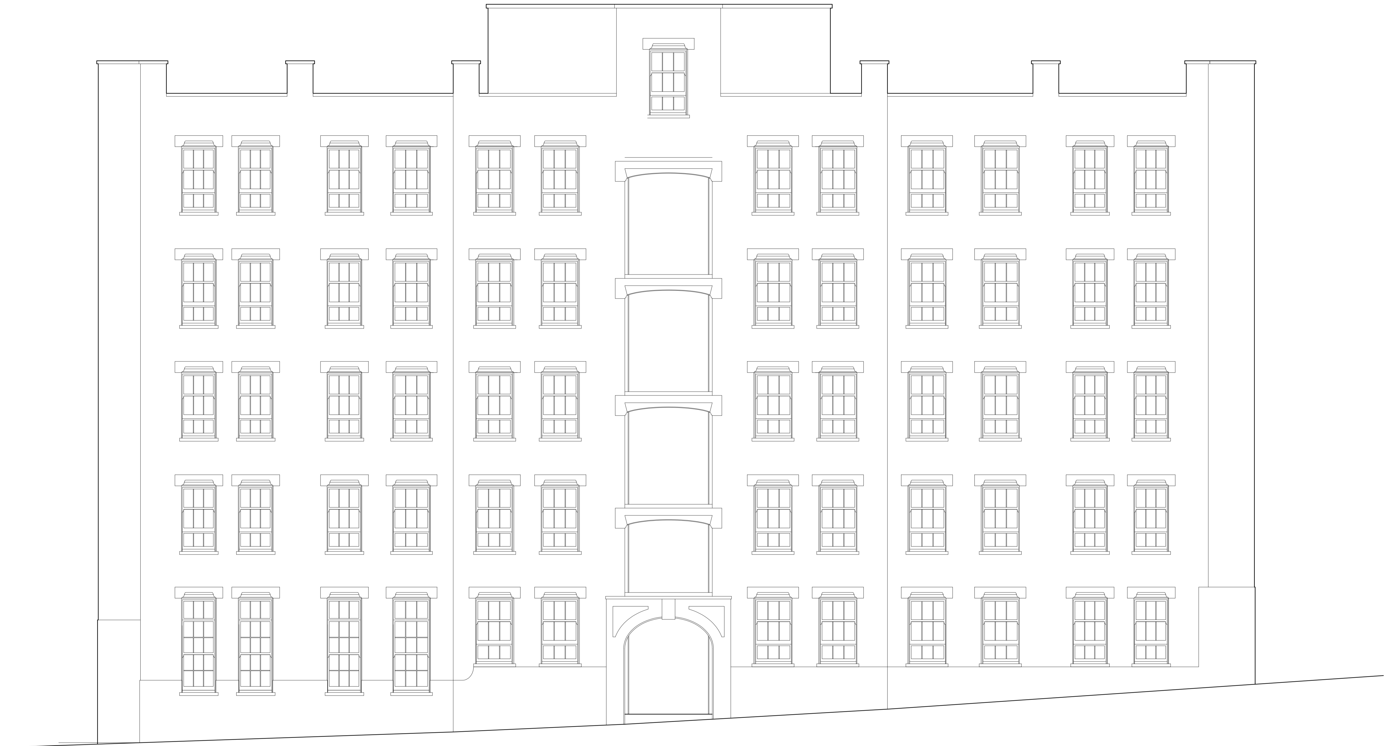
1 Existing South Elevation Scale: 1:50 @ A1 & 1:100 @ A3

Notes: Copyright of this drawing and the contents remain with Pennington Phillips Limited. Do not scale from the drawings. The contractor is to verify dimensions on site prior to the commencement of work. Any discrepancies are to be reported to the designer. If in doubt - seek clarification.