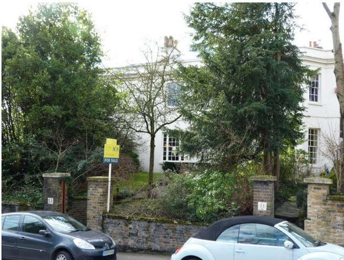
View from street

The orangery would not be visible from the road.