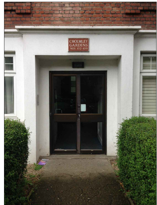
01 A29 ELEVATION DOOR 20_102-109 SCALE 1:25