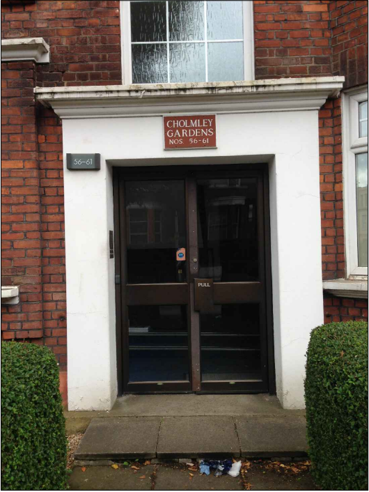
01 ELEVATION DOOR 14_56-61 A23 SCALE 1:25