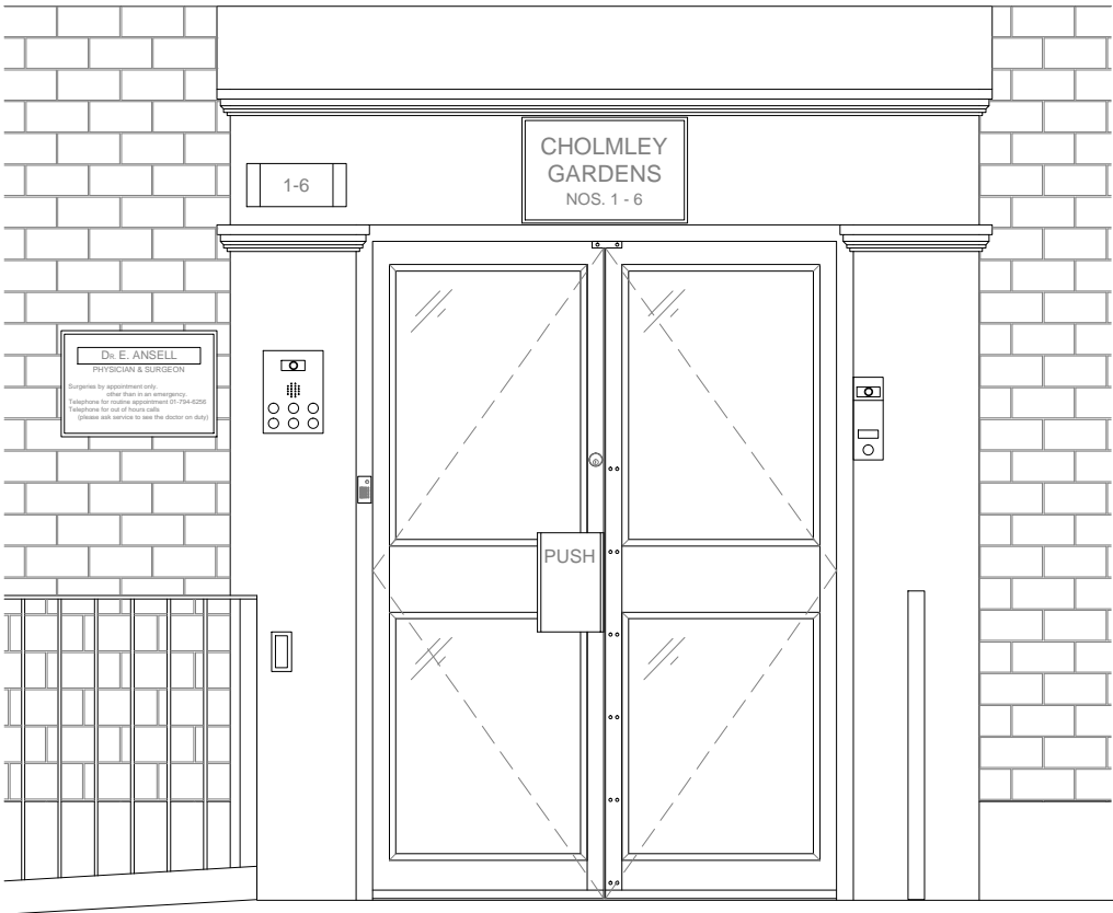
01 A14 ELEVATION DOOR 5_1-6 SCALE 1:25