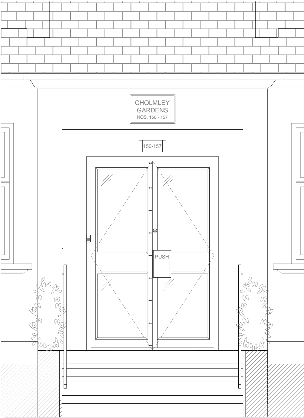
01 A12 ELEVATION DOOR 3_150-157 SCALE 1:25