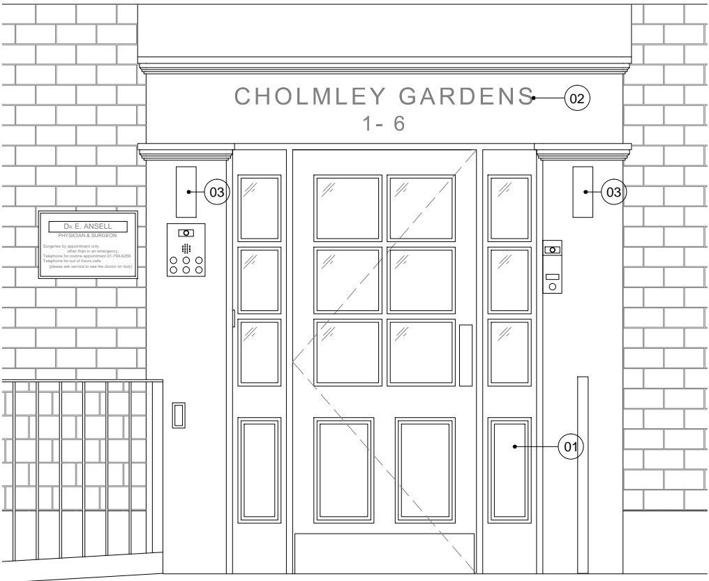
01 A140 ELEVATION DOOR 5_1-6 SCALE 1:25