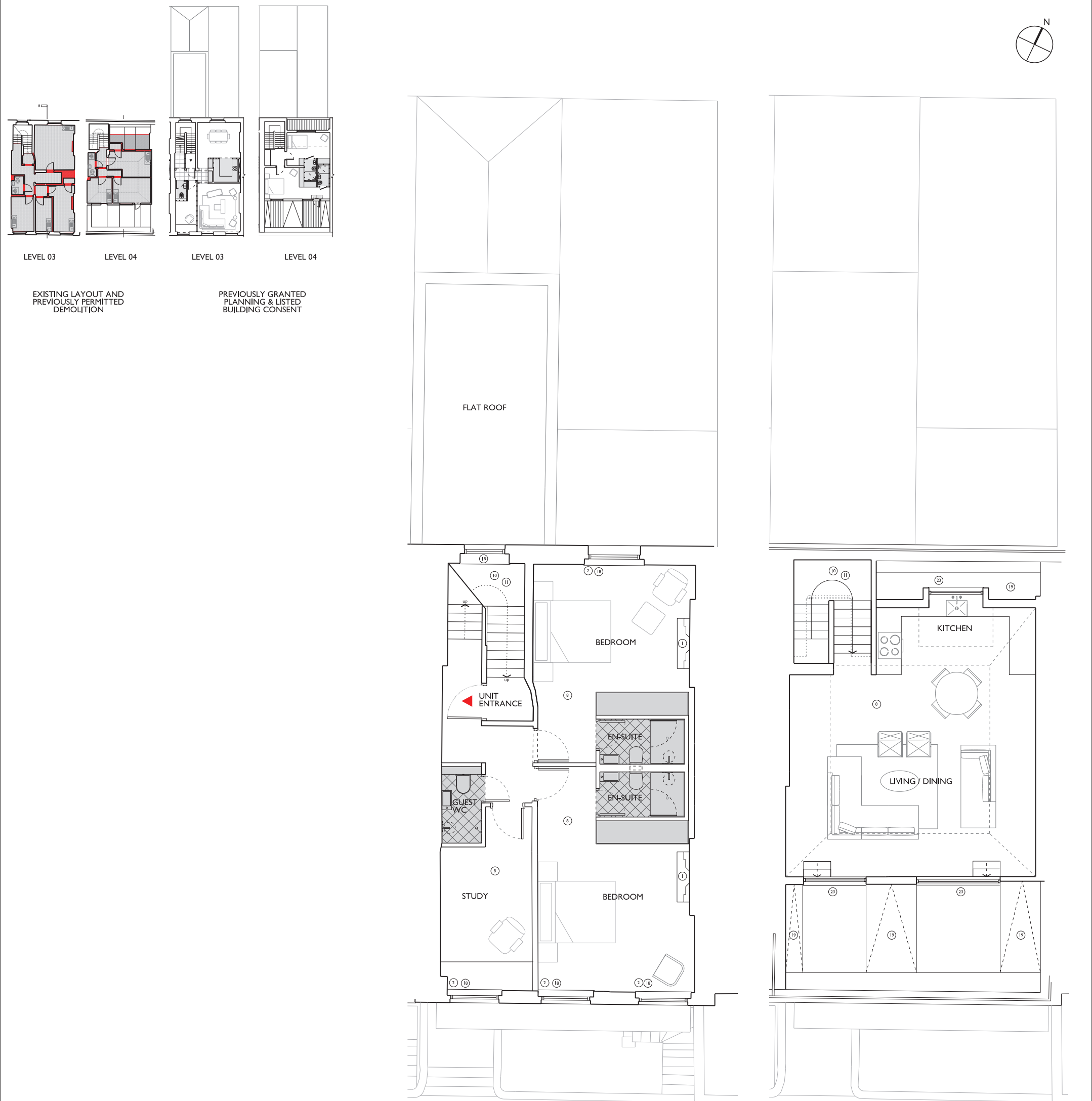
LEVEL 03 - PROPOSED LAYOUT 1:100