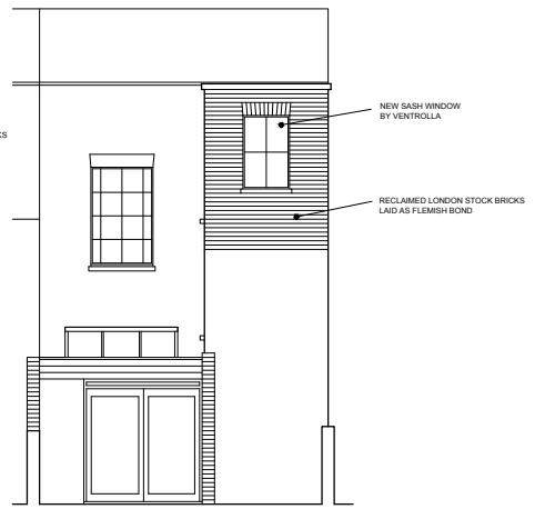
PROPOSED REAR ELEVATION 1:50