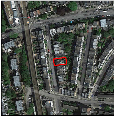
PROPOSED SITE AND BLOCK PLAN