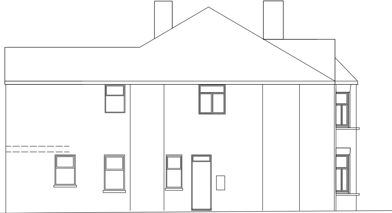
EXISTING SIDE ELEVATION(SOUTH - EAST)