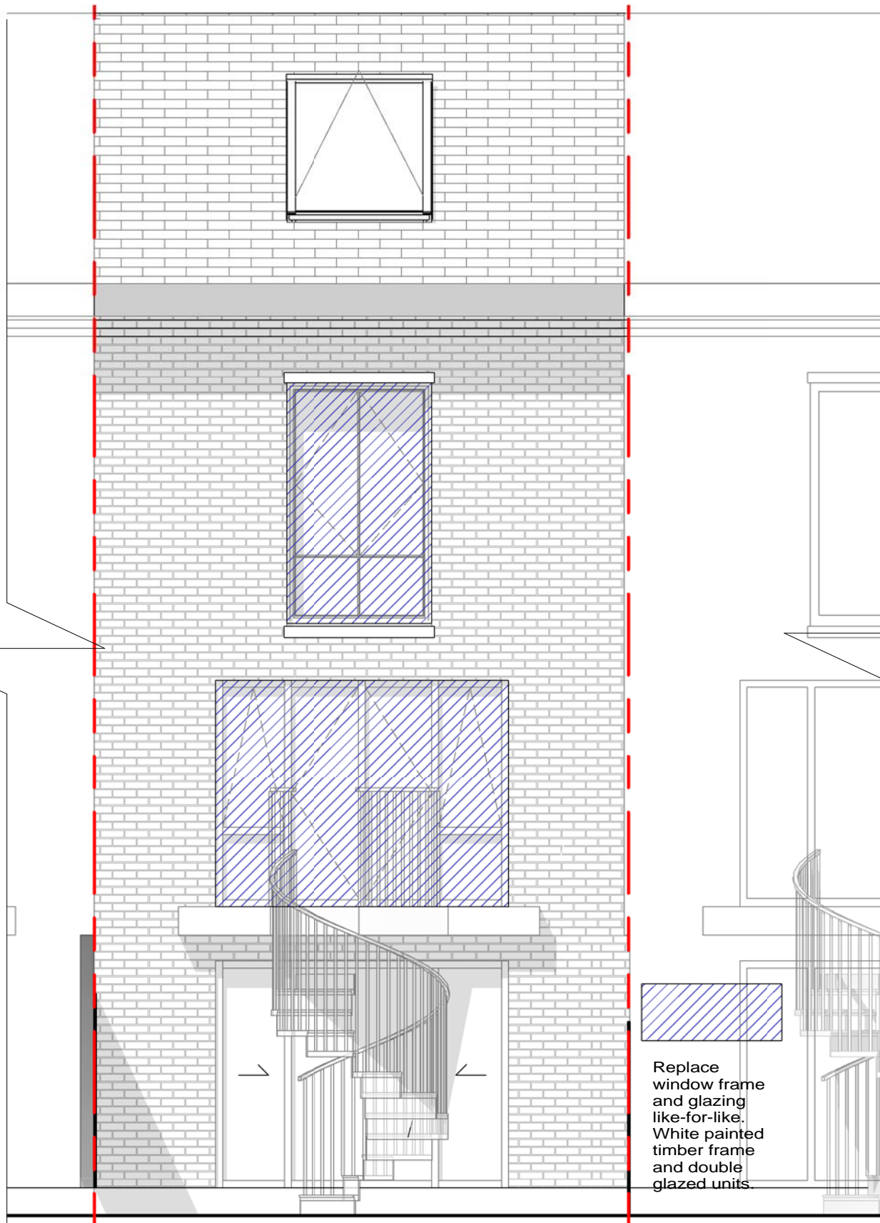
1 Rear Elevation - Consented 1 : 50