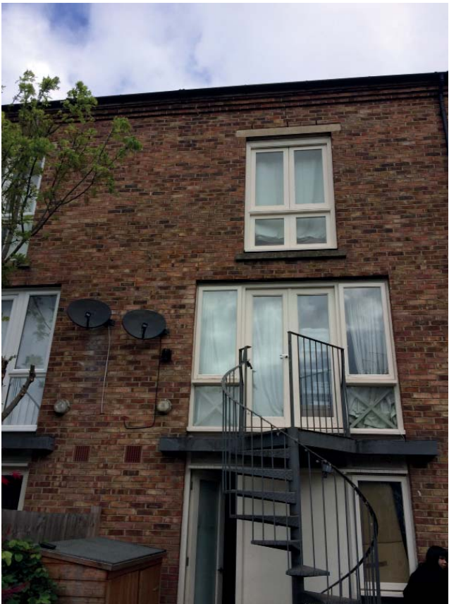
7 St Pauls Mews rear facade