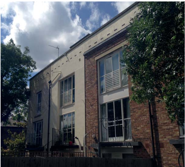
Neighboring buildings with Juliette